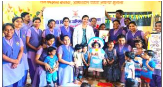
National Children's day Celebration