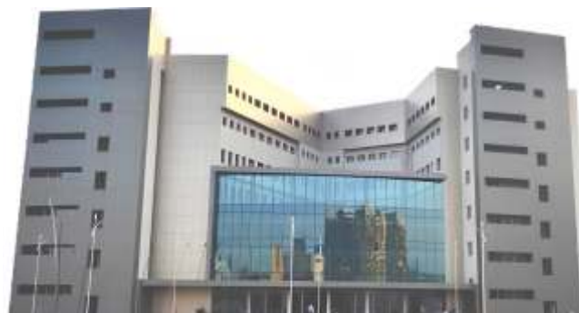
Bharati Vidyapeeth Medicover Hospital, Navi Mumbai

To make the students aware of their social responsibility extension activities conducted are as follows