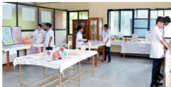
Pre Clinical Lab