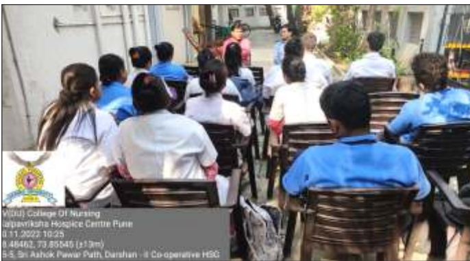
Enhancing Psychomotor Skills