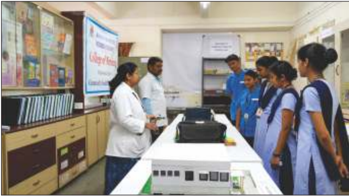
Community Health Nursing Lab