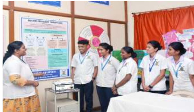
Mental Health Nursing Lab