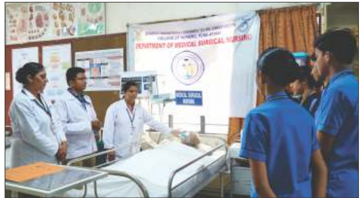
Medical Surgical Nursing Lab