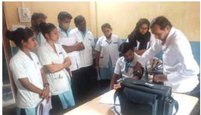
Community Health Nursing Lab