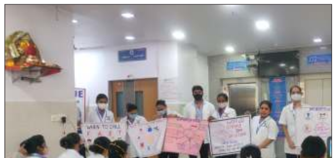
World stroke day 29th October 2022