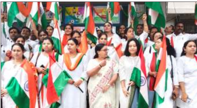
National Festival of Tricolor Celebration