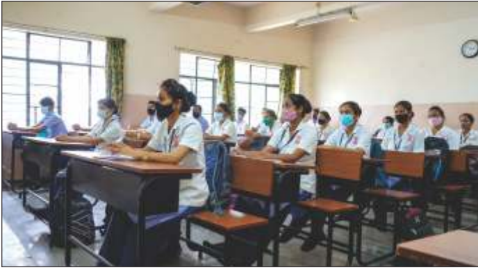
ICT enabled Class Room