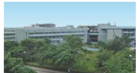
Engineering and Technology