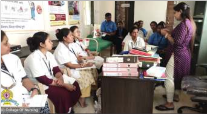
Application of Cognitive Domain