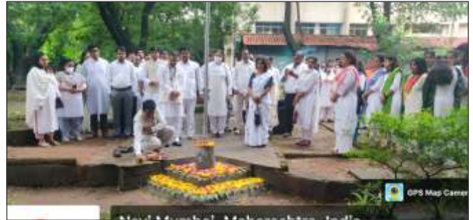
75th Independence day celebration