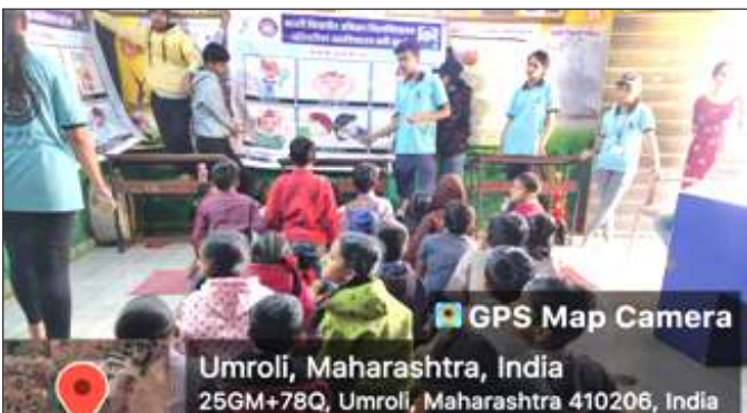
Health talk personal hygiene