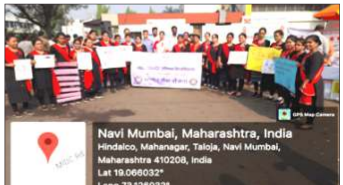
Street play on World AIDS day