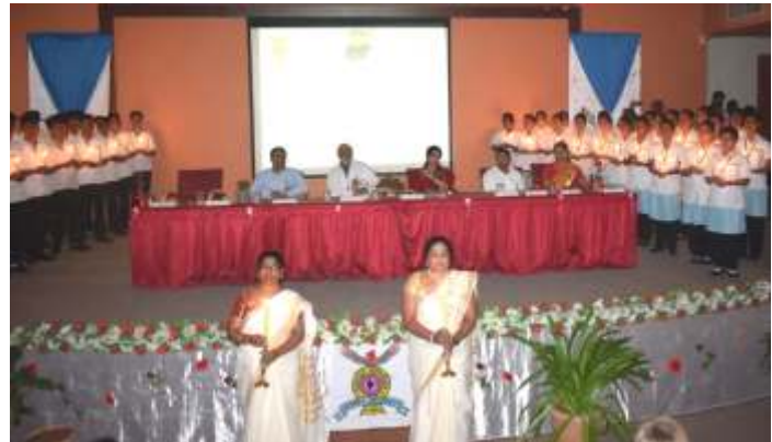
Lamp Lighting Ceremony