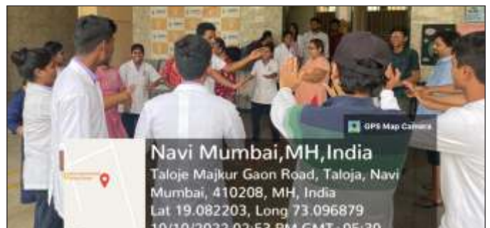
Dance Movement therapy at Jagruti Rehabilitation Centre, Taloja, Navi Mumbai,