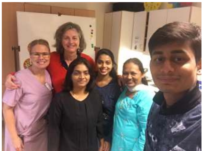
Faculty & Student Exchange program with Malardalen University, Sweden