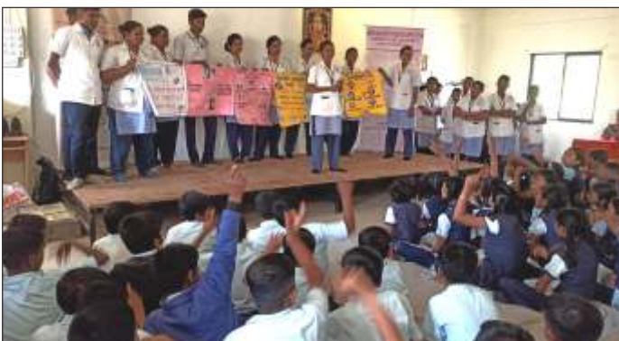
School Health Training & Education