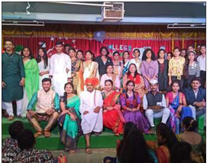
SNA College Week Events