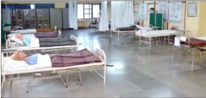
Nursing Foundation Lab