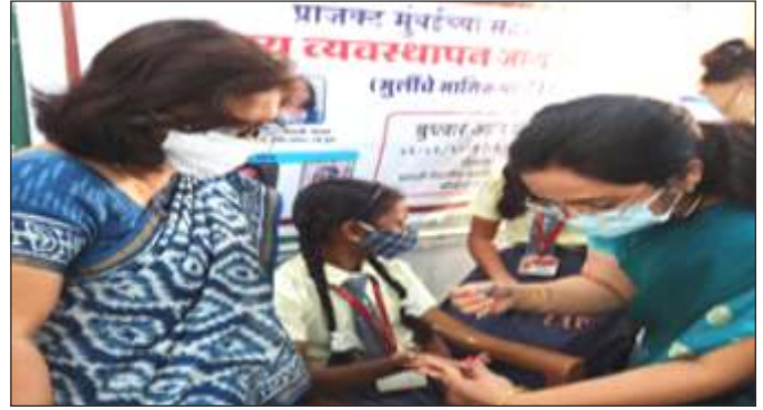
'Research project on Menstrual health management'