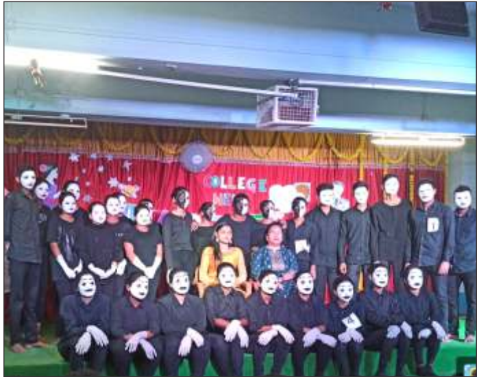
SNA College Week Events