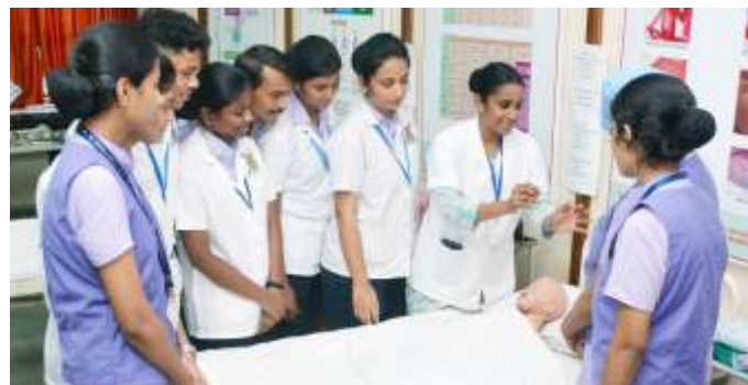
Child Health Nursing Lab