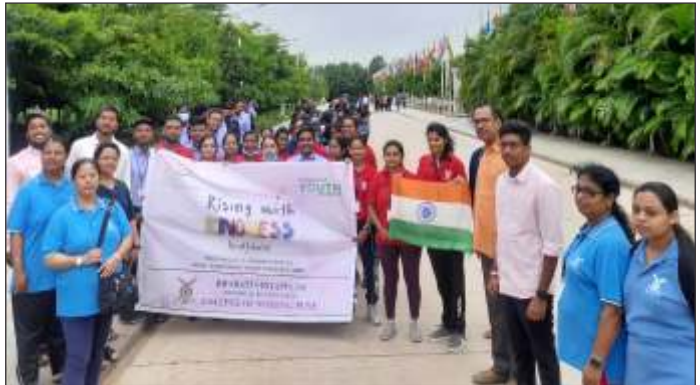
Faculty Members & Students of Bharati Vidyapeeth College of Nursing, Pune representation in Heart fullness Conference at Hyderabad, India