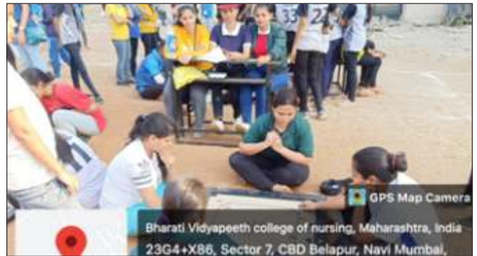
Carrom board event