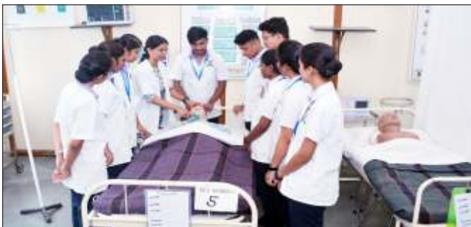
Advance Practice Lab