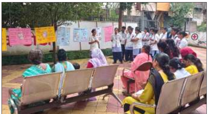
Society Transformation through Community Education