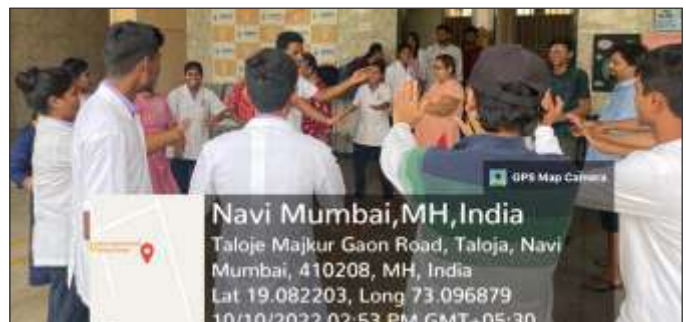
Dance Movement therapy at Jagruti Rehabilitation Centre, Taloja, Navi Mumbai,