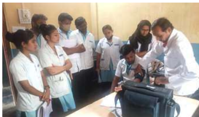
Community Health Nursing Lab