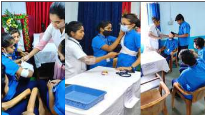
Enhancing Psychomotor Skills