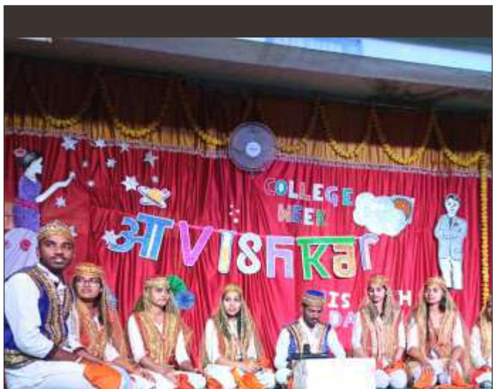
School Health Training & Education