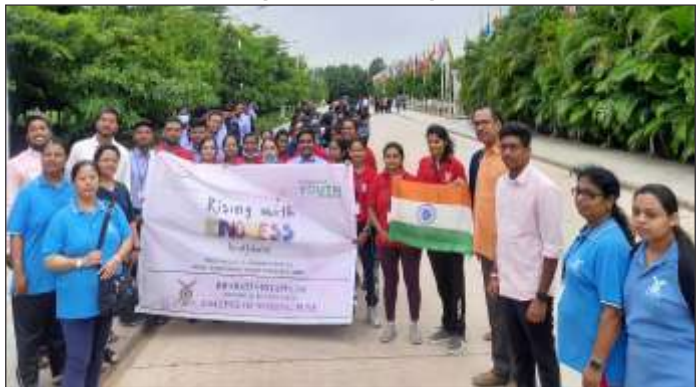
Faculty Members & Students of Bharati Vidyapeeth College of Nursing, Pune representation in Heart fullness Conference at Hyderabad, India