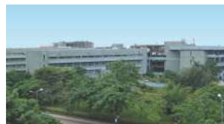
Engineering and Technology