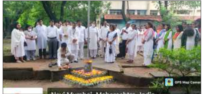
75th Independence day celebration