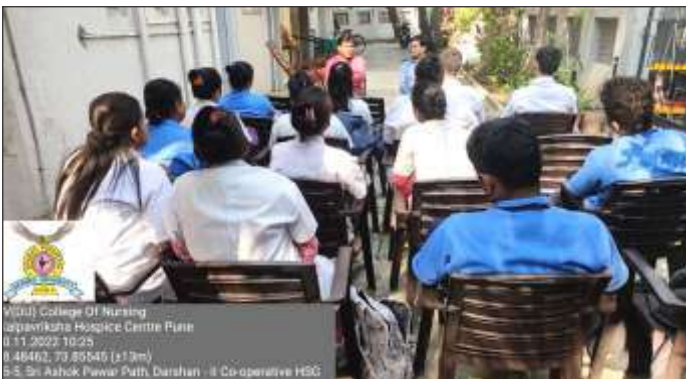
Enhancing Psychomotor Skills