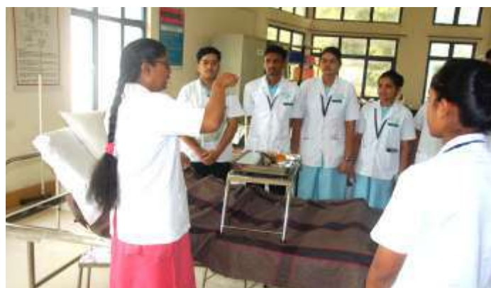
Fundamental Nursing Lab