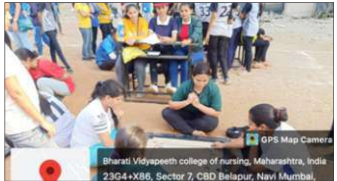
Carrom board event