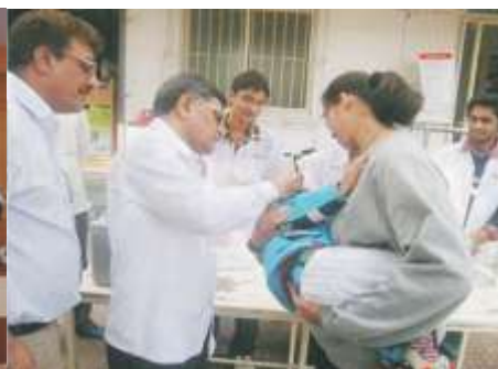
Participation in Polio vaccination campaign