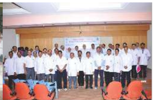
Celebration of Pharmacists Day