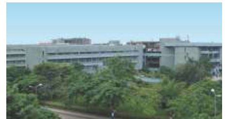
Engineering and Technology