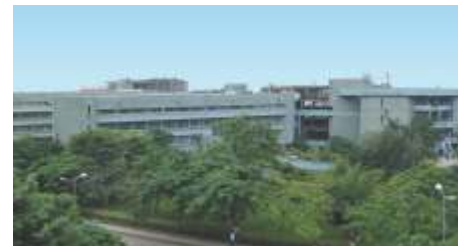
Engineering and Technology