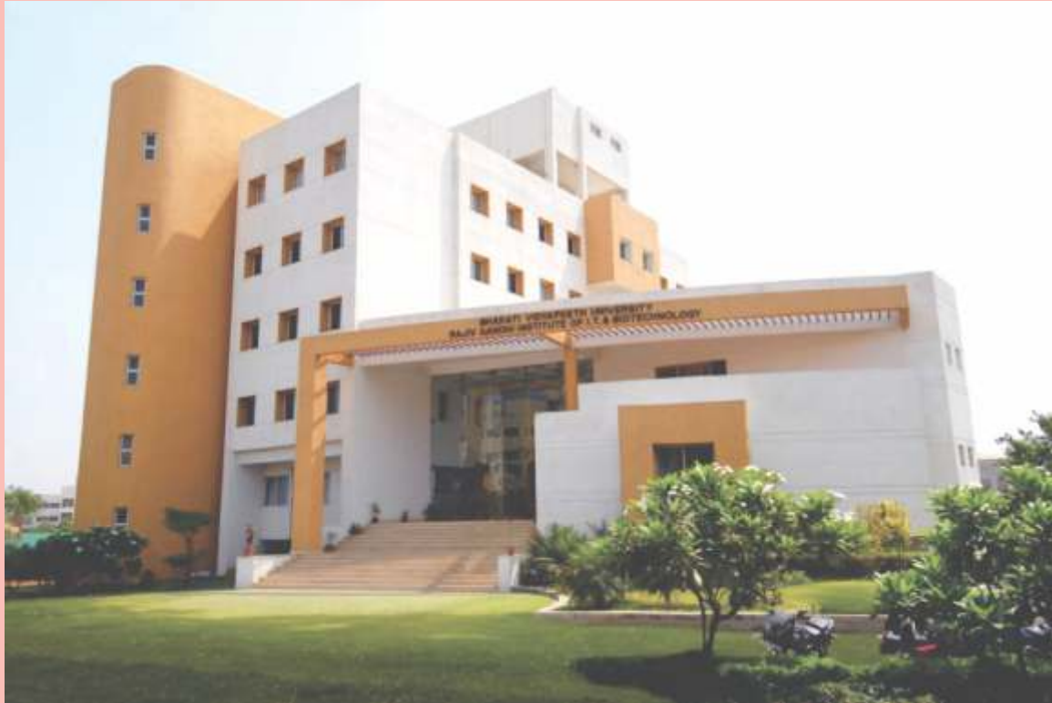
Rajiv Gandhi Institute of I. T. & Biotechnology