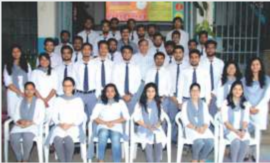
Students Placed in TCS 2018-19