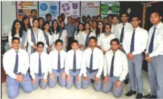
Students Placed in LTI 2017-18