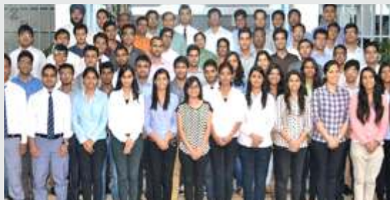
Students Placed in TCS 2014-15