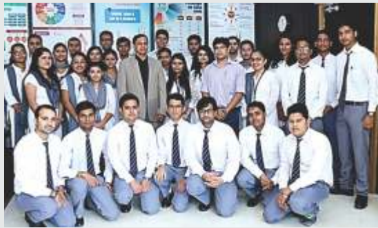
Students Placed in TCS 2016-17