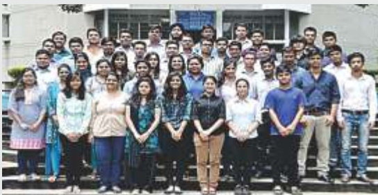
Students Placed in TCS 2015-16