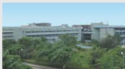
Engineering and Technology