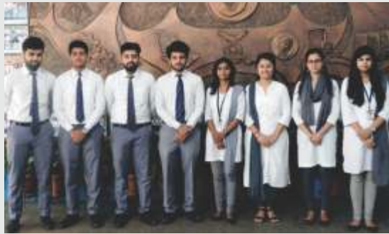
Students Placed in Cybage 2017-18