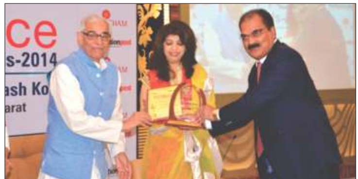
Best Management Institute Award conferred on IMED by ASSOCHAM at the hands of Honble Governor of Gujarat Shri. O P Kohli.