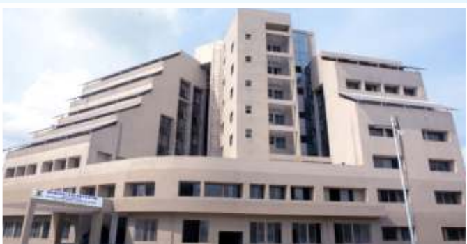
Department of Management Studies, Navi Mumbai