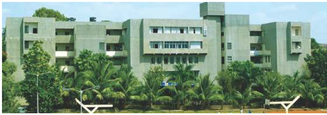
Institute of Management and Entrepreneurship Development, Pune