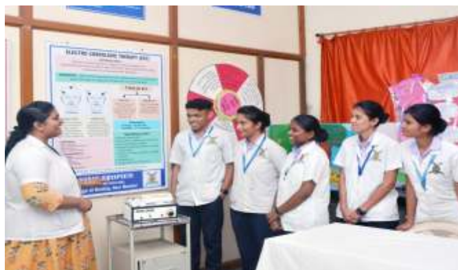
Mental Health Nursing Lab