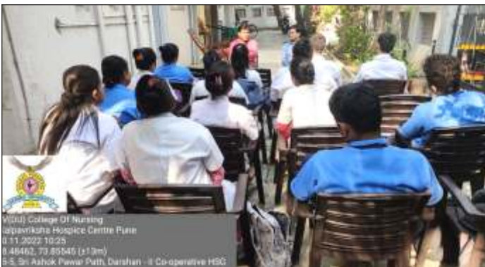
Enhancing Psychomotor Skills