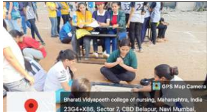
Carrom board event