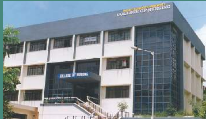
College of Nursing, Pune