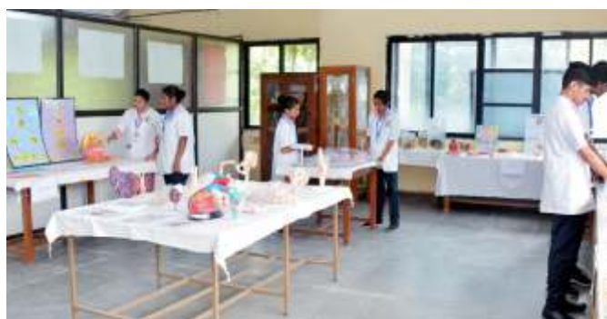
Pre Clinical Lab