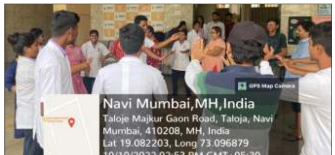
Dance Movement therapy at Jagruti Rehabilitation Centre, Talaja, Navi Mumbai,