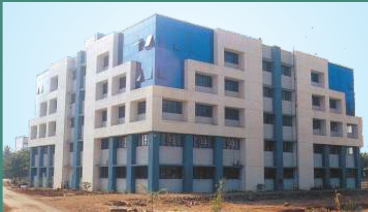
College of Nursing, Navi Mumbai