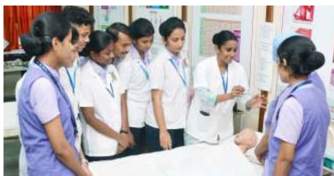
Child Health Nursing Lab