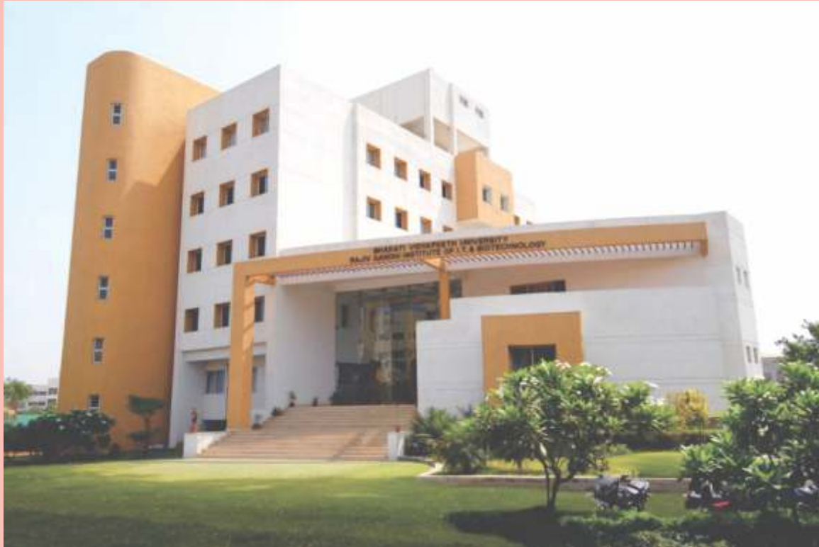
Rajiv Gandhi Institute of I. T. & Biotechnology