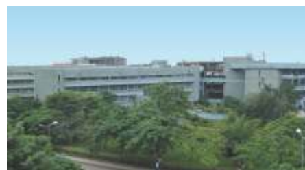
Engineering and Technology