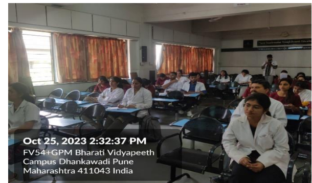
Faculty members attending clinical sessions