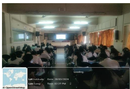
Intern giving presentation