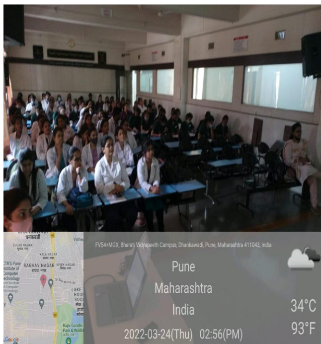
Interns and Pg Scholars attending the session,