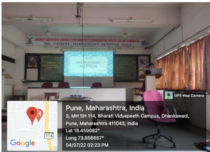
Intern Aishwarya explaining the case.