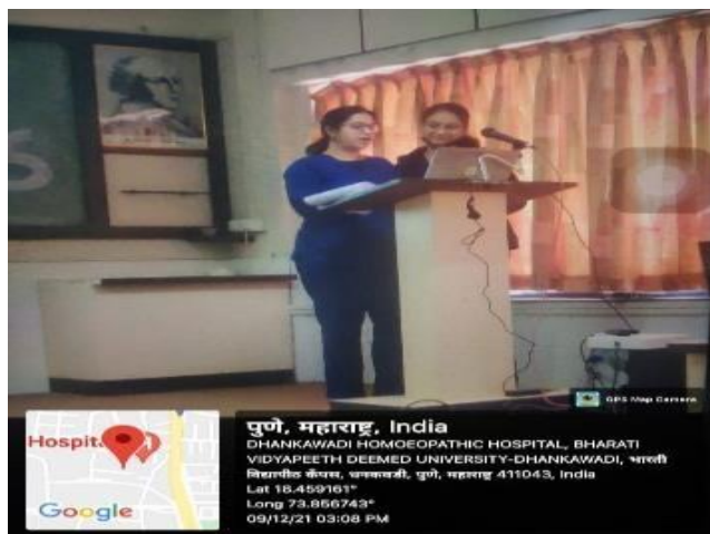
Saltnat & Samruddhi- Homoeopathic therapeutics of PCOS.