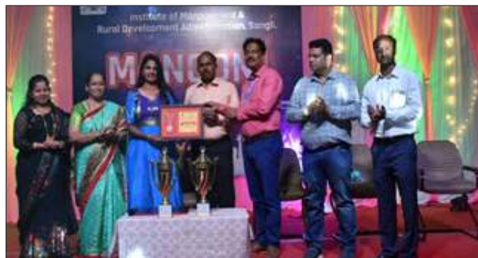
Annual Academic, Cultural and Sports Event- MANCON