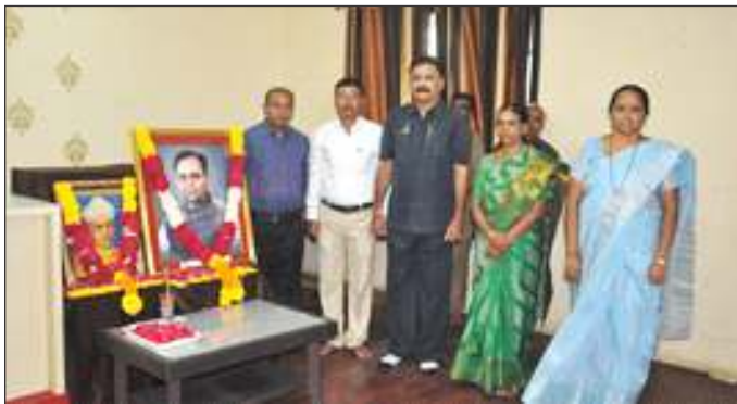
Teacher's Day Celebration