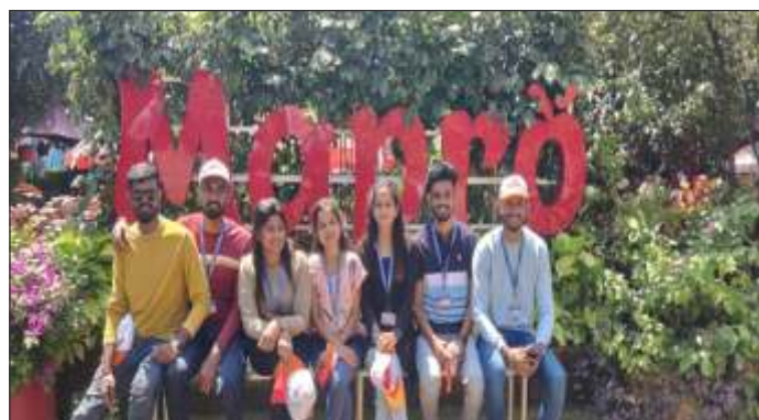
Industrial Visits MBA Sem III visit to MAPRO at WAI Satara District