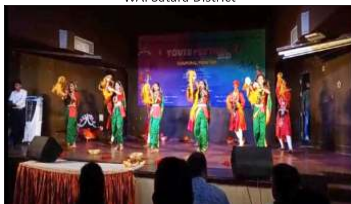
Youth Festival Participation