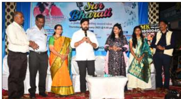
Surbharati- Annual Musical Event