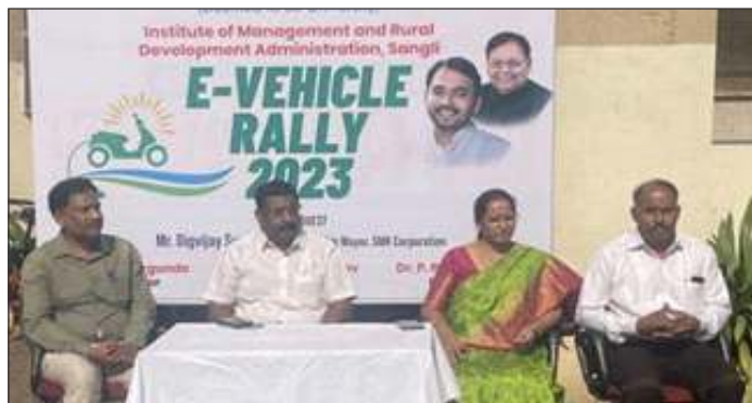
Societal Outreach Programmes Promotion of Clean Environment by using eBikes.