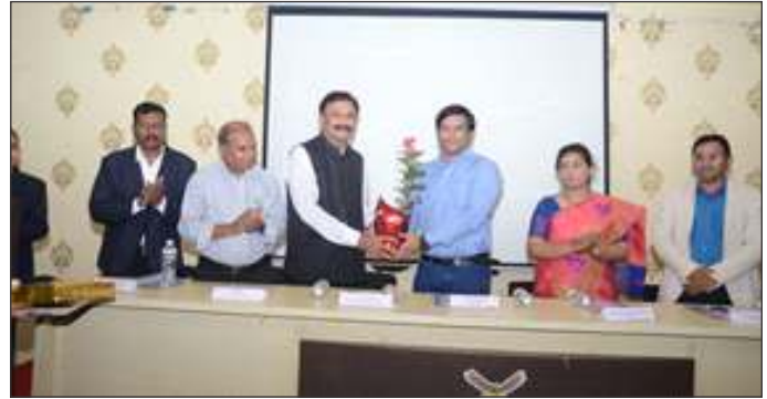
Induction Programme: One Week BBA, BCA Programme Orientation Sessions