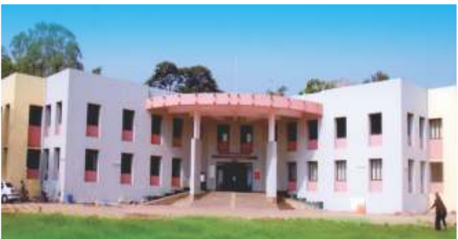
Yashwantrao Mohite Institute of Management, Karad