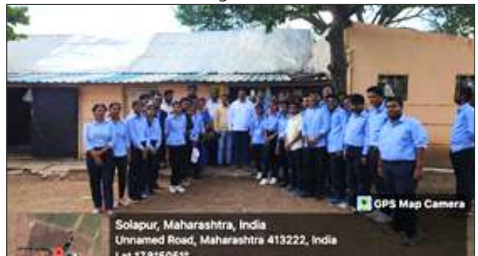
Industrial Visit: visit at Sonaka farm and DKS Poultry farm