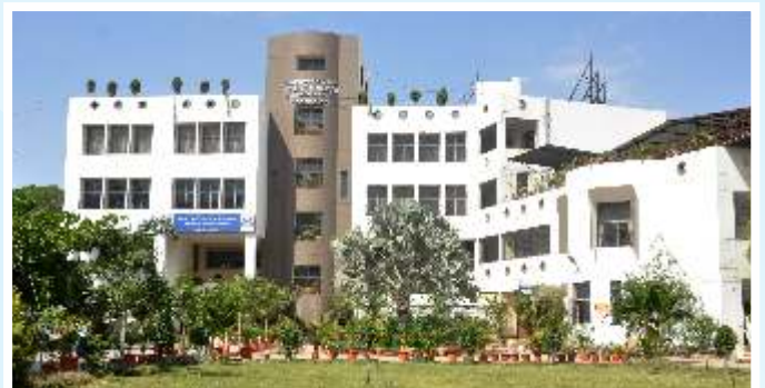
Abhijit Kadam Institute of Management and Social Science, Solapur