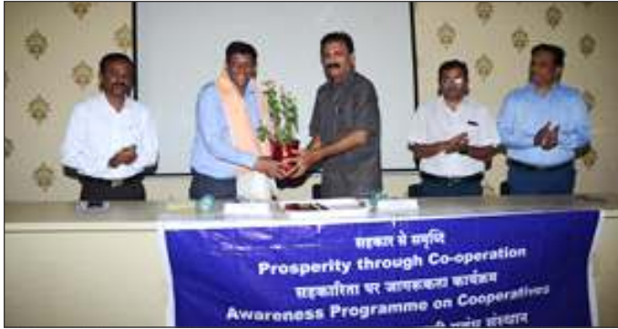
Prosperity through Cooperation: One day Awareness Session on Cooperation