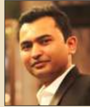
Global Compliance Manager

My experience at IMED was extremely wonderful, especially in the marketing area. Practical examples and cases, which were discussed in the class, are helping me a lot in the Industry.