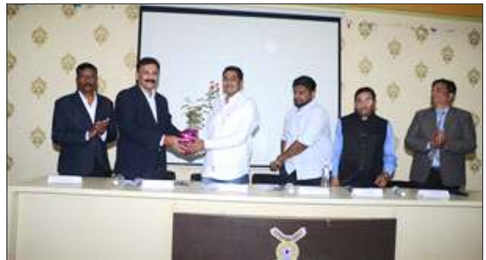
Induction Programme: One Week MBA, BBA Programme Orientation Sessions