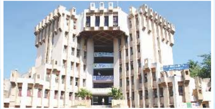
Institute of Management and Rural Development Administration, Sangli