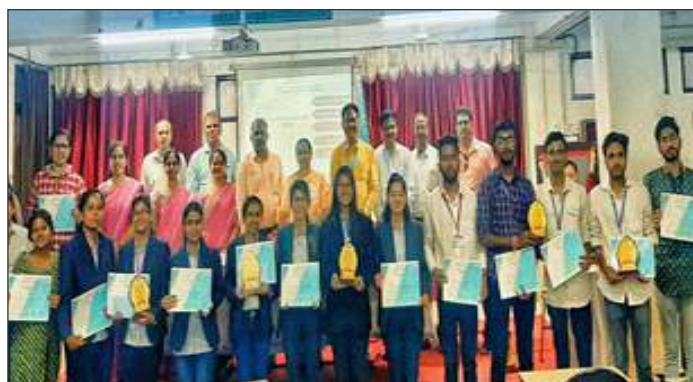
TechnoCraker- Annual Intercollegiate Event