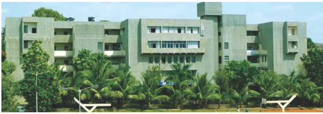
Institute of Management and Entrepreneurship Development, Pune