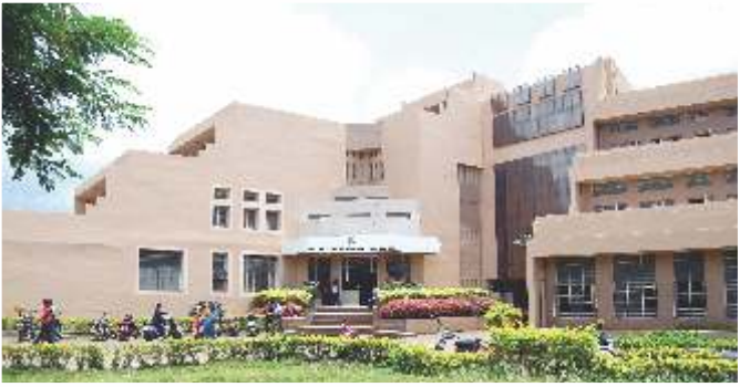
Institute of Management, Kolhapur