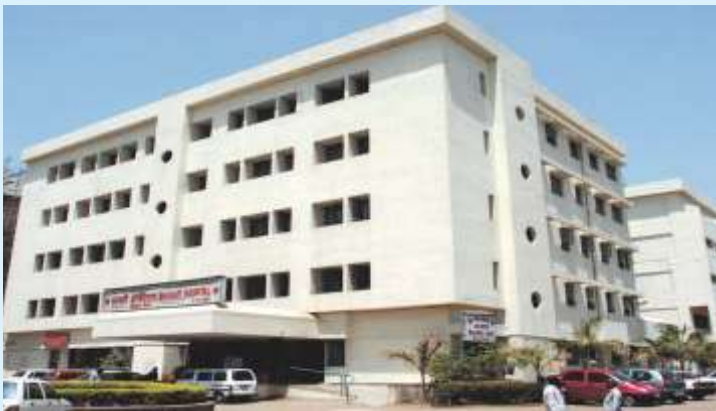
Bharati Hospital, Pune