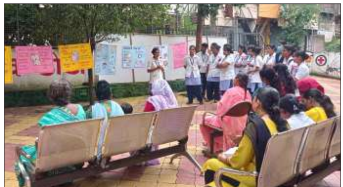
Society Transformation through Community Education