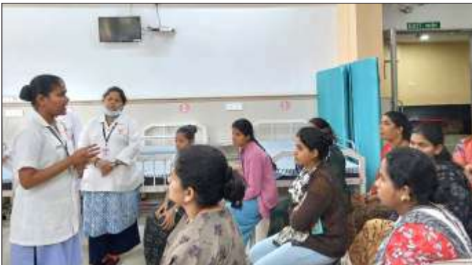
Patient Teaching at Bharati Hospital and Research Centre, Pune