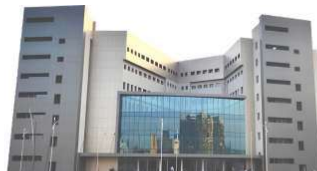
Bharati Vidyapeeth Medicover Hospital, Navi Mumbai

To make the students aware of their social responsibility extension activities conducted are as follows