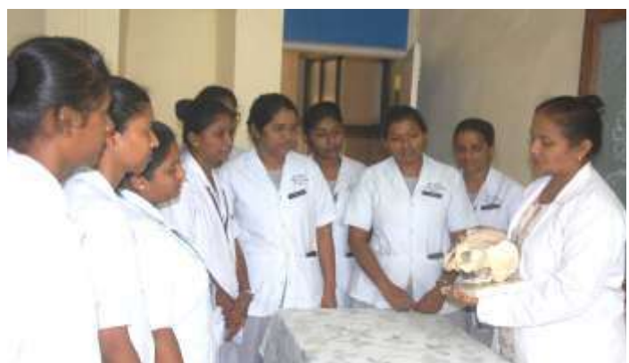
Maternal Nursing Lab