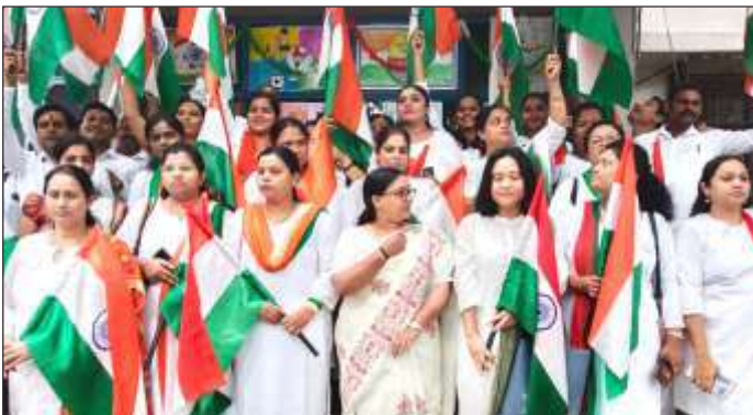
National Festival of Tricolor Celebration