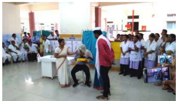
World Breast feeding Week Celebration