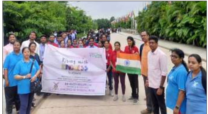
Faculty Members & Students of Bharati Vidyapeeth College of Nursing, Pune representation in Heart fullness Conference at Hyderabad, India