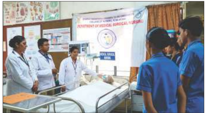
Medical Surgical Nursing Lab