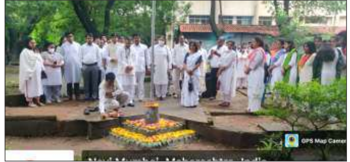
75th Independence day celebration