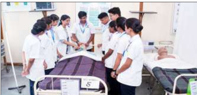
Advance Practice Lab