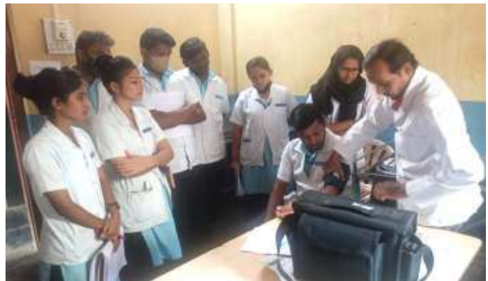
Community Health Nursing Lab