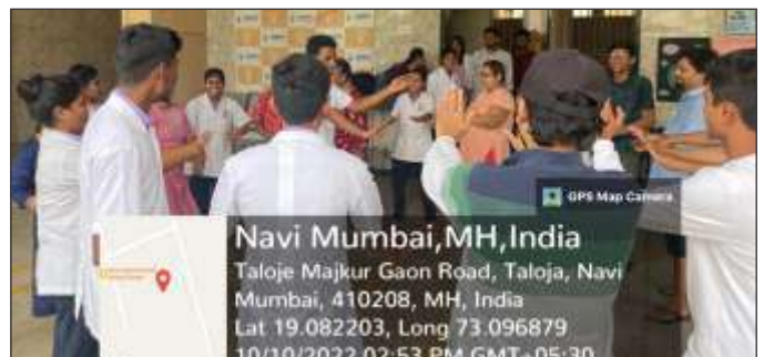
Dance Movement therapy at Jagruti Rehabilitation Centre, Taloja, Navi Mumbai,