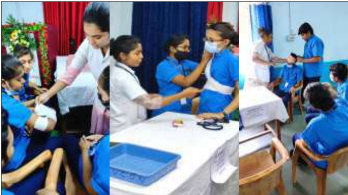
Enhancing Psychomotor Skills