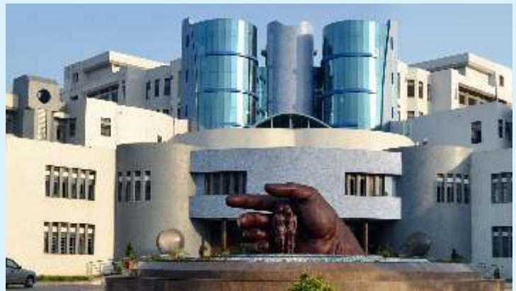
Bharati Hospital, Sangli