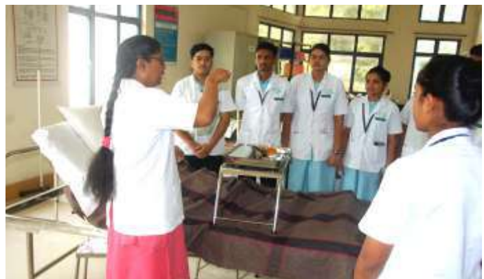
Fundamental Nursing Lab