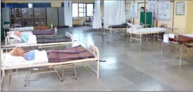
Nursing Foundation Lab