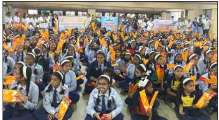
Community Welfare Activity "Distribution of Sanitary Pads to Adolscent Girls"