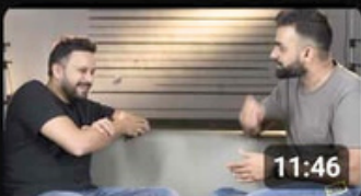
I AM BVSP EP 01 Featuring Varun Sa...