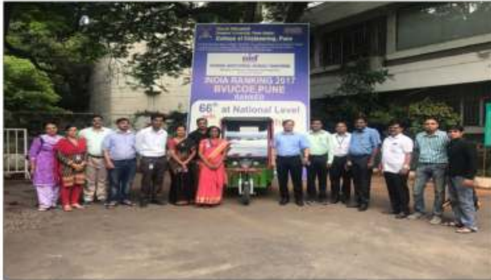
Ph.D project of e-Rickshaw