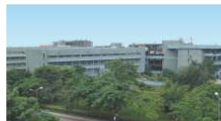
Engineering and Technology