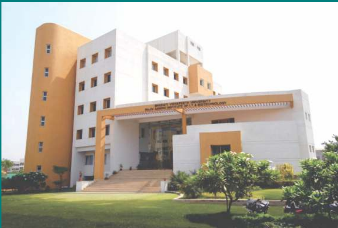
Rajiv Gandhi Institute of I. T. & Biotechnology