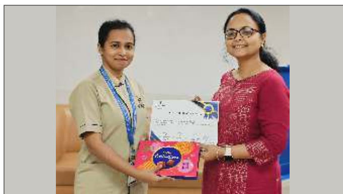
Student Appreciation - Regional