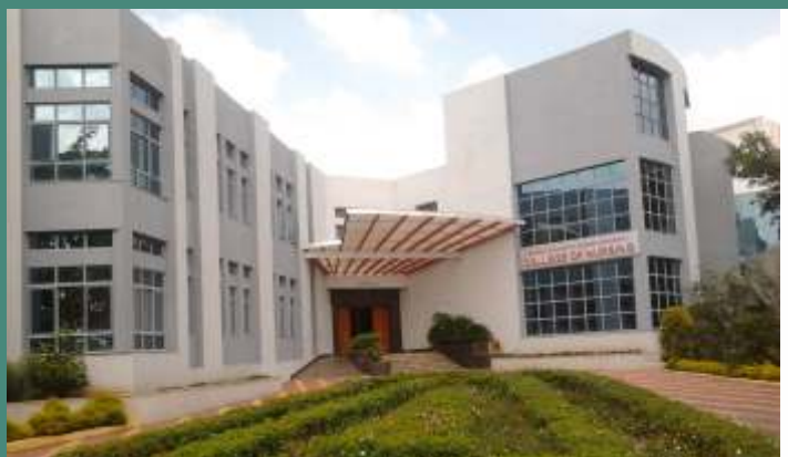
College of Nursing, Sangli