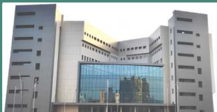
Bharati Medicover Hospital, Navi Mumbai