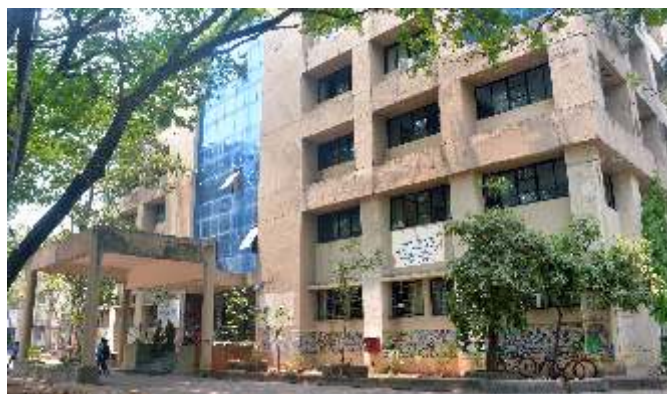
College of Nursing, Navi Mumbai

Dean, Faculty of Nursing & Principal College of Nursing, Navi Mumbai