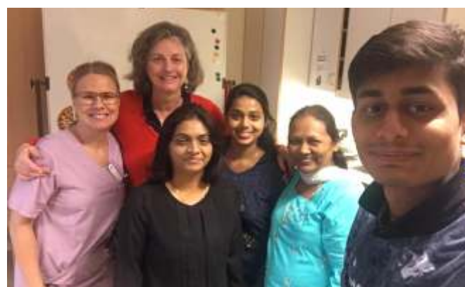
Faculty & Student Exchange program with Malardalen University, Sweden