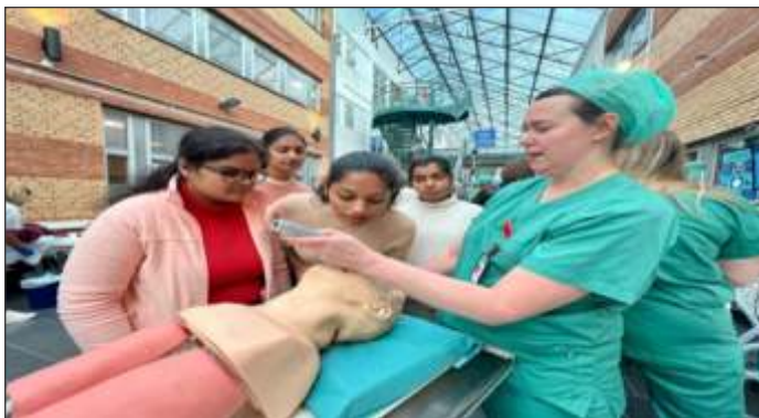
Enhancing Psychomotor Skills