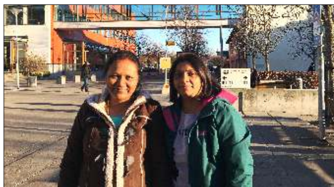
Faculty Exchange Program with Malardalen University, Sweden