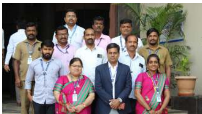
Non Teaching Staff