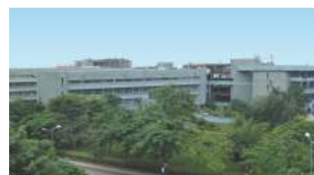
Engineering and Technology