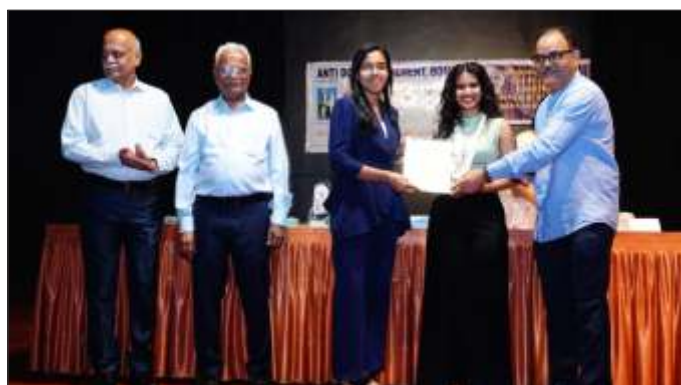
Student Appreciation - State