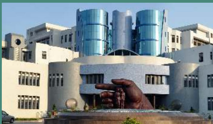
Bharati Hospital, Sangli