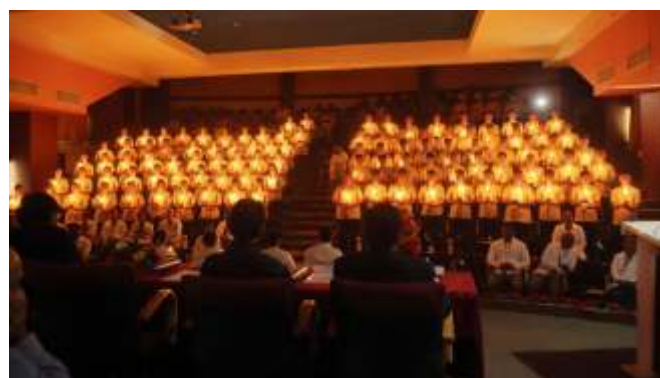
Lamp lighting and oath taking ceremony