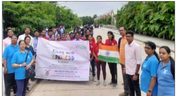
Faculty Members & Students of Bharati Vidyapeeth College of Nursing, Pune representation in Heart fullness Conference at Hyderabad, India