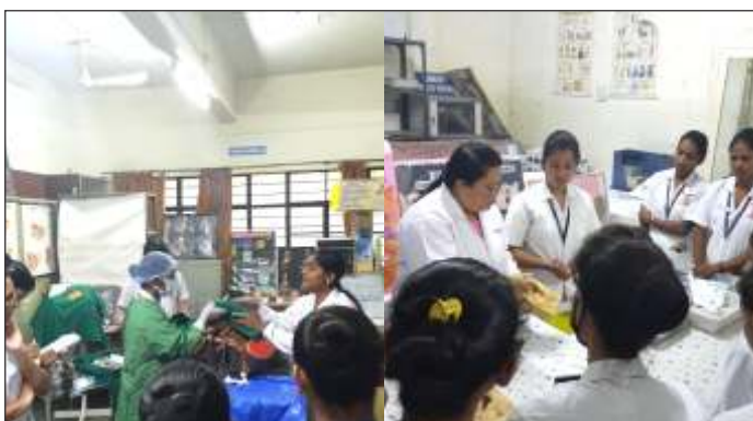
Obstetrics & Gyaecological skill stations at Bharati Vidyapeeth College of Nursing, Pune