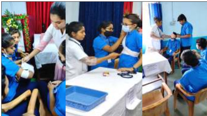
Enhancing Psychomotor Skills