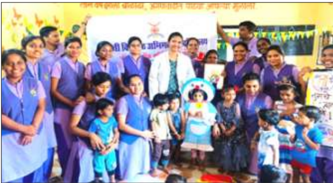
National Children's day Celebration