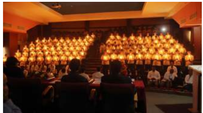
Lamp lighting and oath taking ceremony