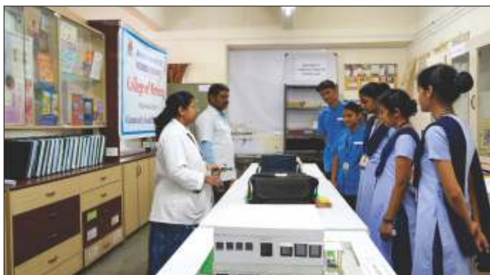
Community Health Nursing Lab