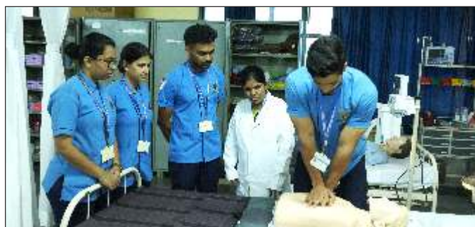
Nursing Foundation Lab