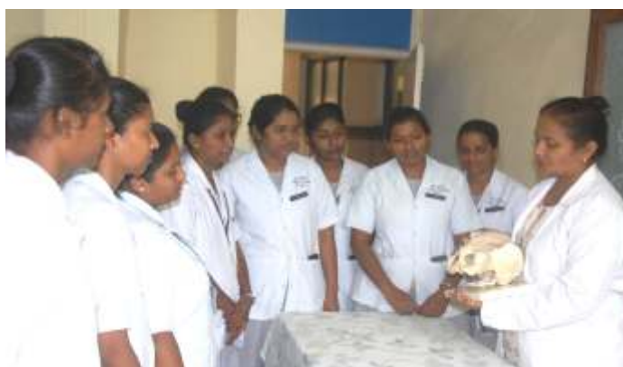
Maternal Nursing Lab