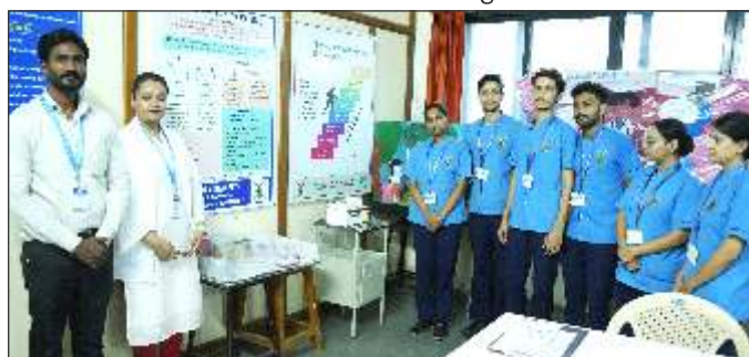
Mental health Nursing lab