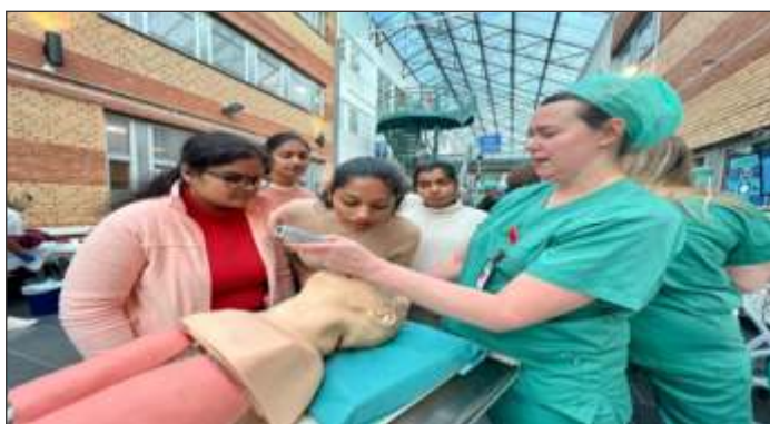
Enhancing Psychomotor Skills