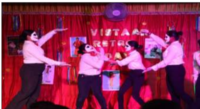
Student Nurses Association Events