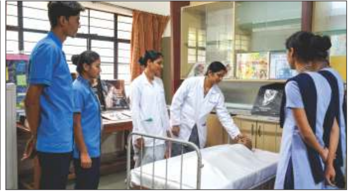
Child Health Nursing Lab