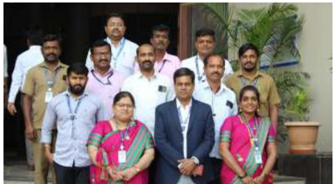
Non Teaching Staff