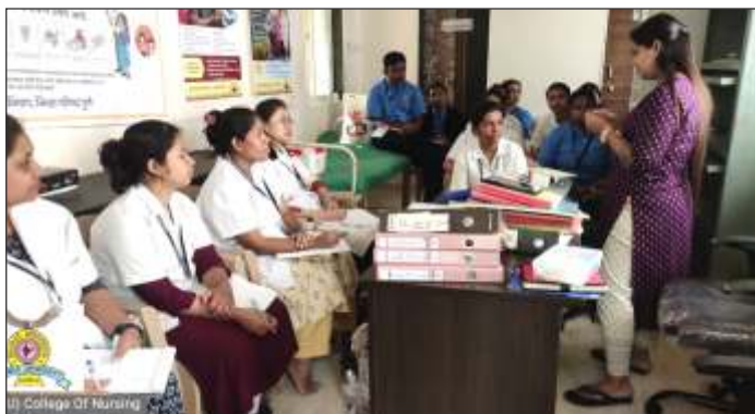
Application of Cognitive Domain