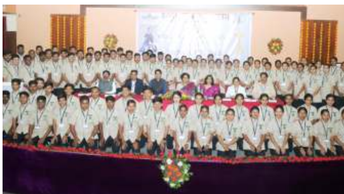
Lamp lighting and oath taking ceremony 2024-2025