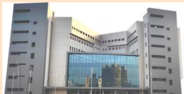
Bharati Medicover Hospital, Navi Mumbai