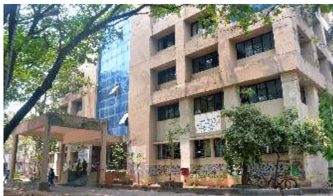
College of Nursing, Navi Mumbai

Dean, Faculty of Nursing & Principal College of Nursing, Navi Mumbai