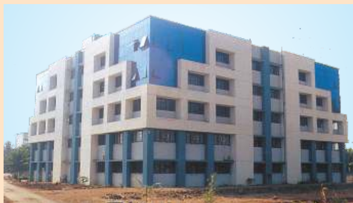
College of Nursing, Navi Mumbai