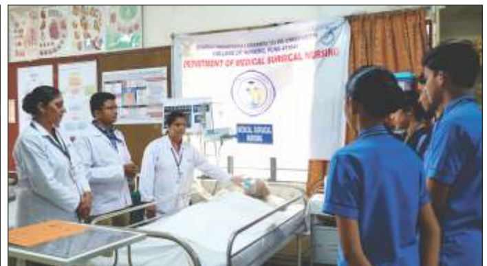
Medical Surgical Nursing Lab