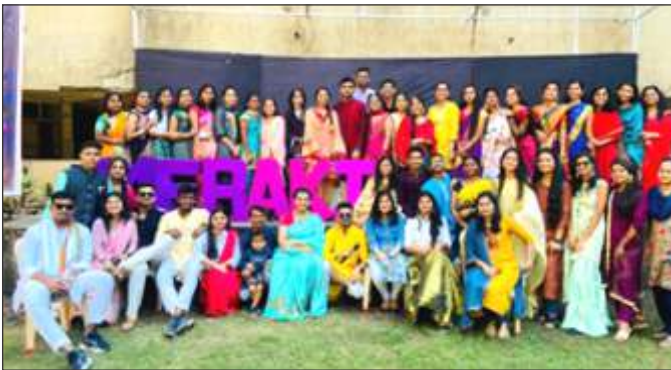
SNA 'College week event'