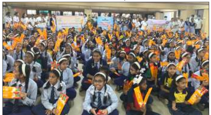
Community Welfare Activity "Distribution of Sanitary Pads to Adolscent Girls"