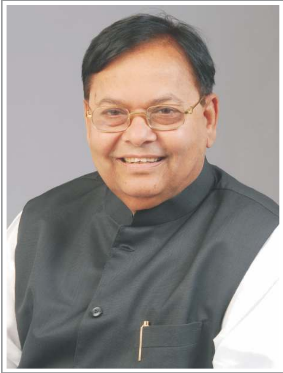
Hon'ble Dr. Patangrao Kadam