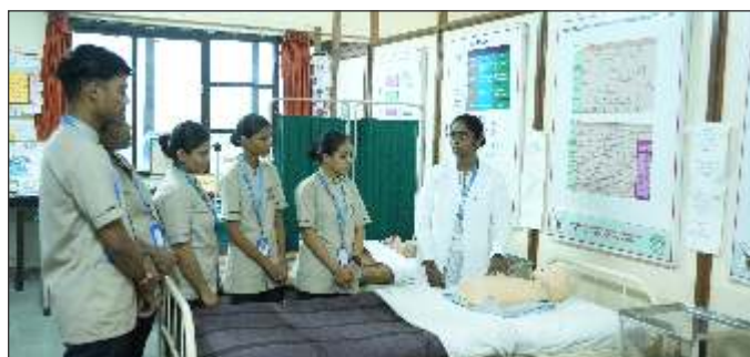
Child Health Nursing Lab