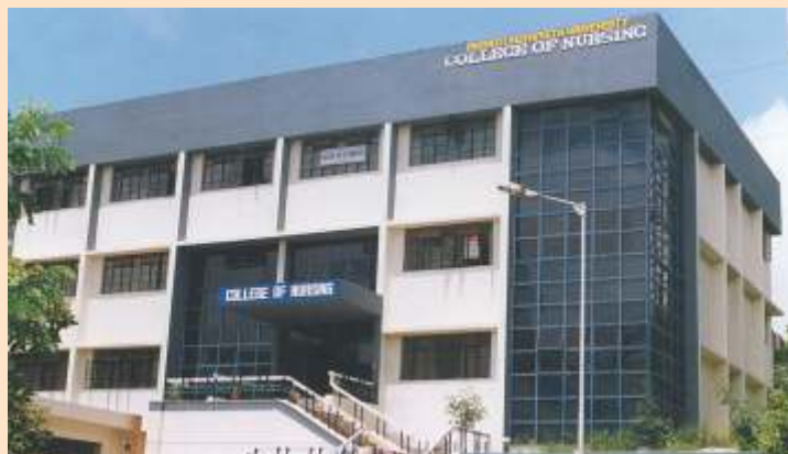
College of Nursing, Pune