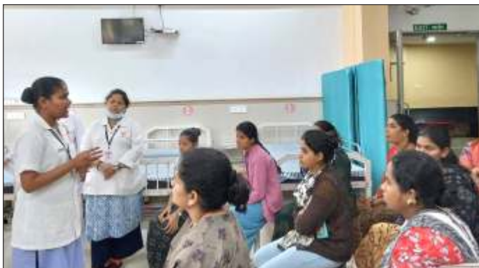
Patient Teaching at Bharati Hospital and Research Centre, Pune