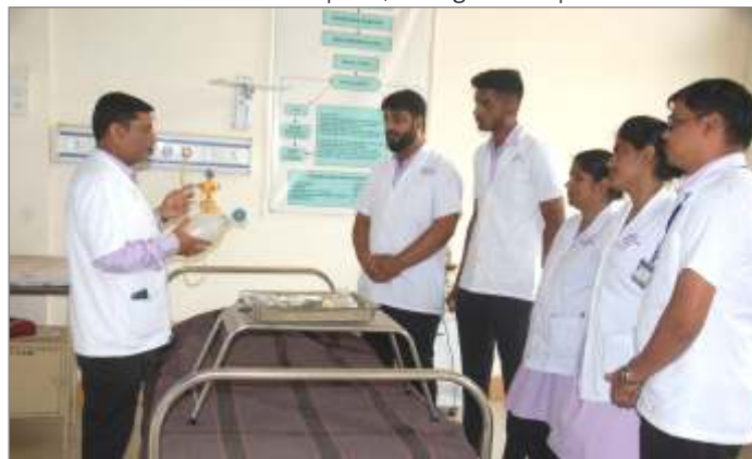
Advance Nursing Lab