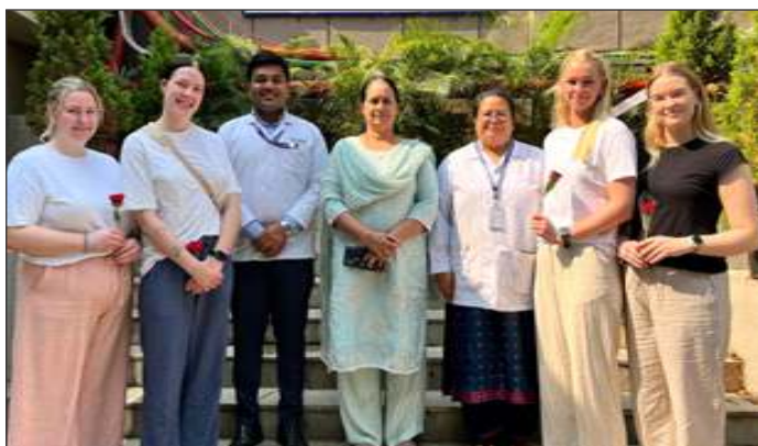
International Students Exchange Programme