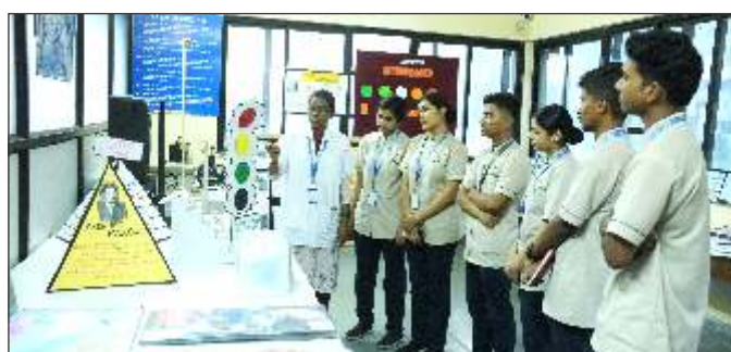
AV Aids Lab