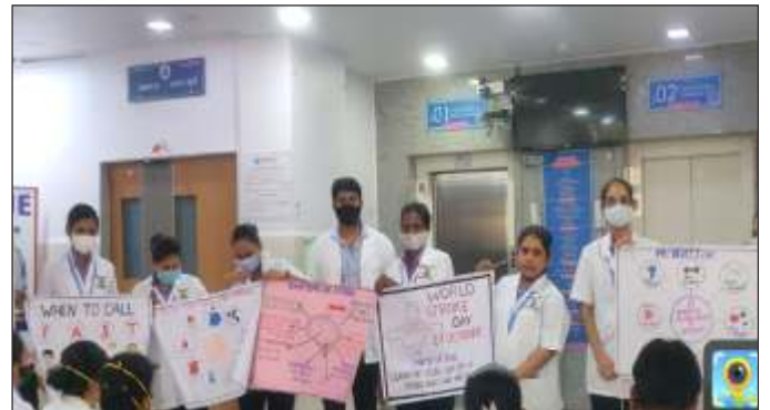
World stroke day 29th October 2022