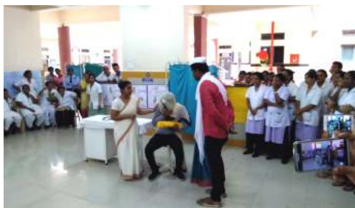
Health Days Celebrations