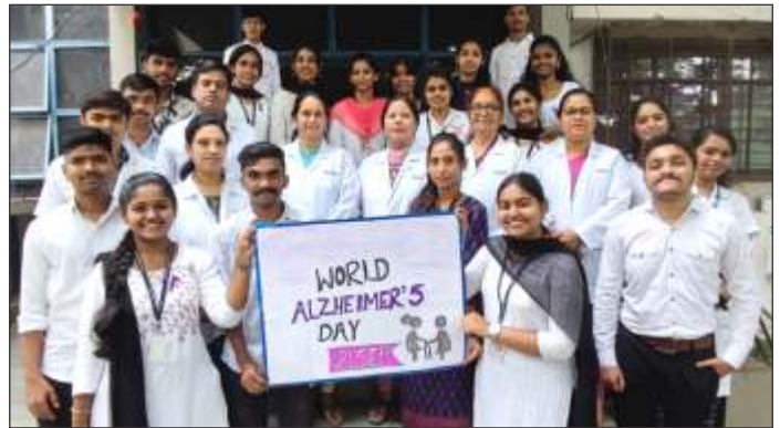
Health Day Celebration at Bharati Vidyapeeth College of Nursing, Pune