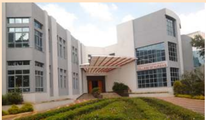
College of Nursing, Sangli