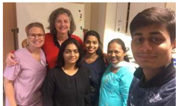
Faculty & Student Exchange program with Malardalen University, Sweden