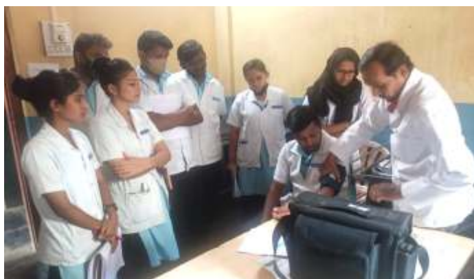
Community Health Nursing Lab