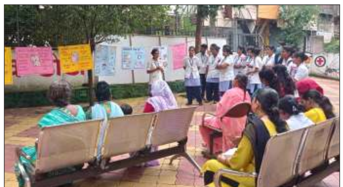
Society Transformation through Community Education