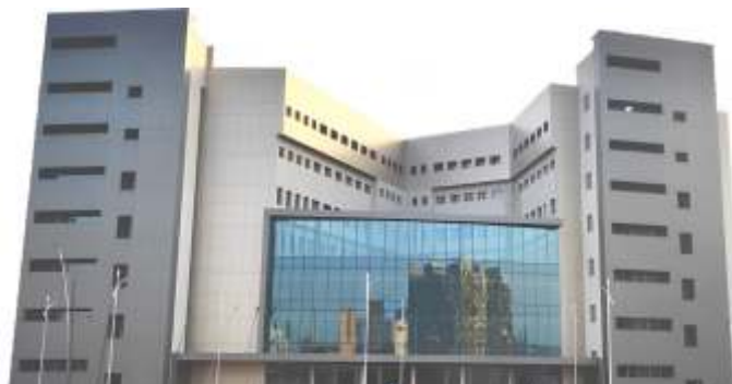
Bharati Medicover Hospital, Navi Mumbai