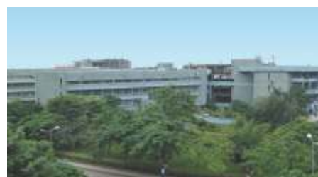
Engineering and Technology