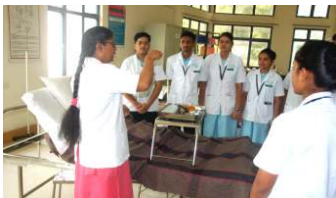
Fundamental Nursing Lab