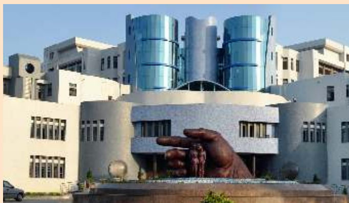
Bharati Hospital, Sangli