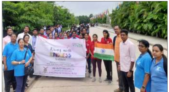
Faculty Members & Students of Bharati Vidyapeeth College of Nursing, Pune representation in Heart fullness Conference at Hyderabad, India