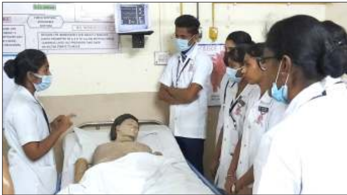
Application of Cognitive Domain