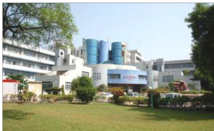
Bharati Hospital, Sangli Campus