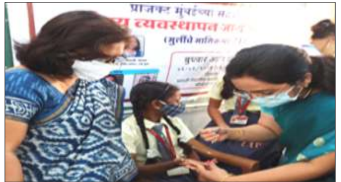
'Research project on Menstrual health management'