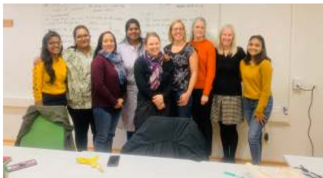
Student Exchange Program with Malardalen University, Sweden