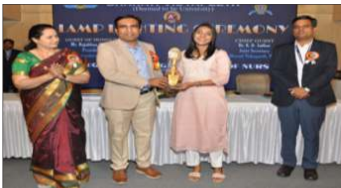
Students Awards & Honors