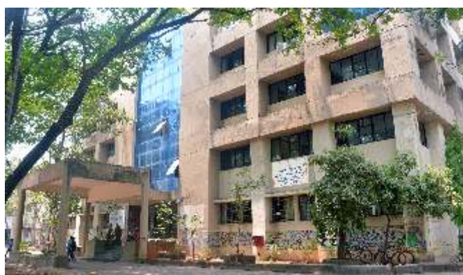
College of Nursing, Navi Mumbai

Dean, Faculty of Nursing & Principal College of Nursing, Navi Mumbai