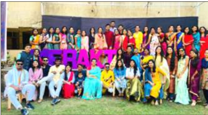
SNA 'College week event'