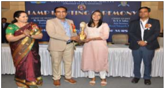
Students Awards & Honors