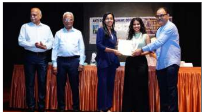
Student Appreciation - State

"I am a proud alumnus (2010-2014) of Bharati Vidyapeeth College of Nursing, Navi Mumbai. My experience at BVCON was transformative. The education, support, and clinical experience provided a strong foundation for my nursing career"