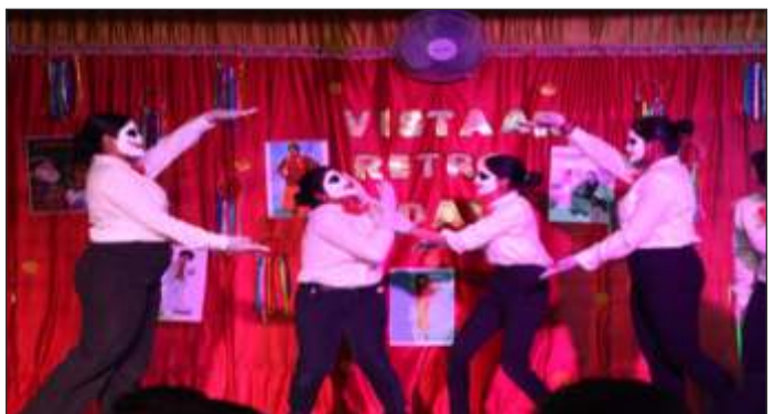
Student Nurses Association Events