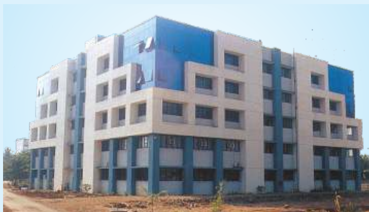
College of Nursing, Navi Mumbai