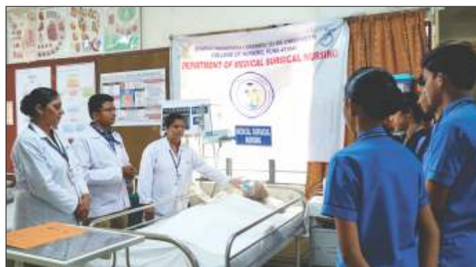
Medical Surgical Nursing Lab