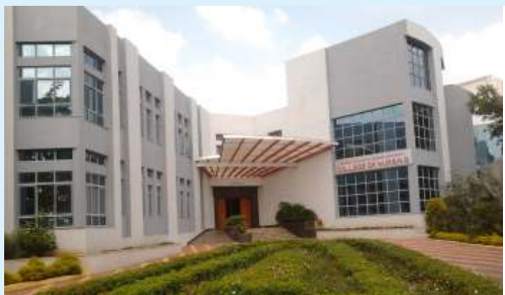
College of Nursing, Sangli