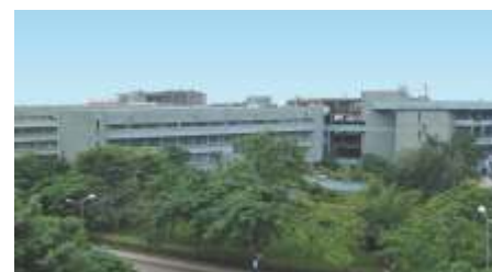
Engineering and Technology