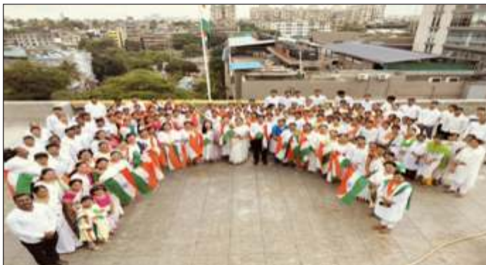
National Festival of Tricolor Celebration