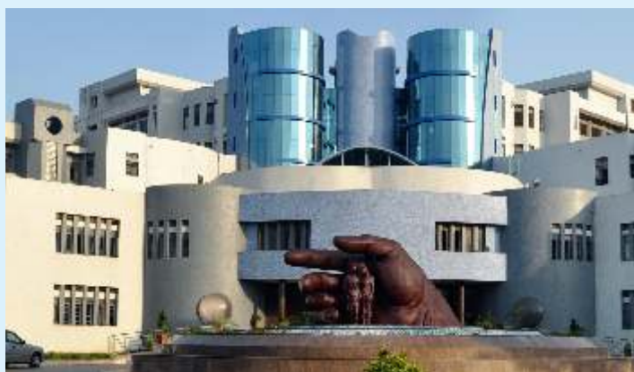
Bharati Hospital, Sangli