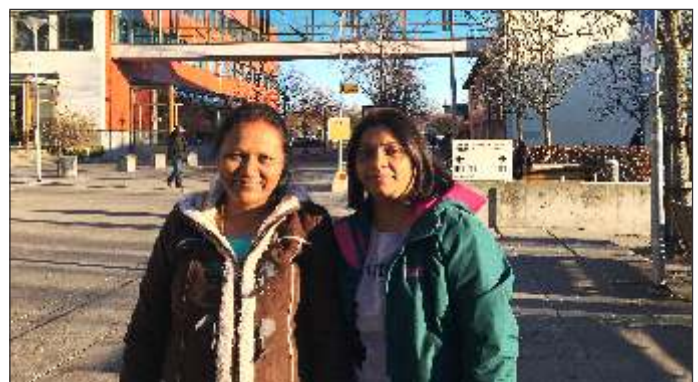
Faculty Exchange Program with Malardalen University, Sweden