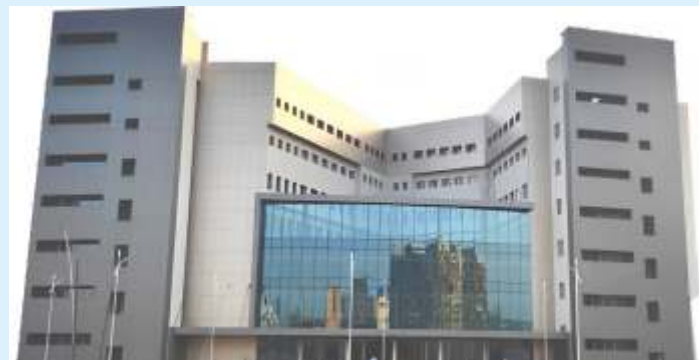
Bharati Medicover Hospital, Navi Mumbai