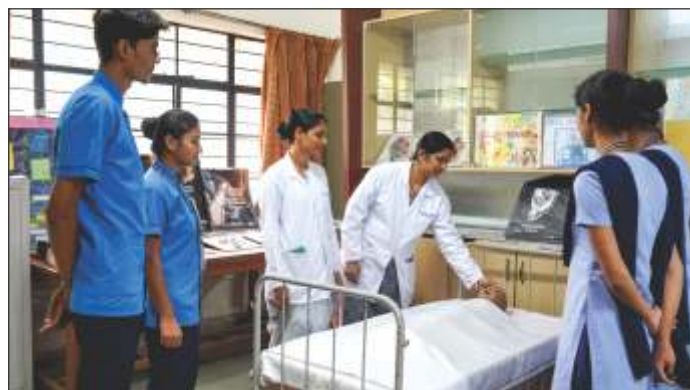
Child Health Nursing Lab