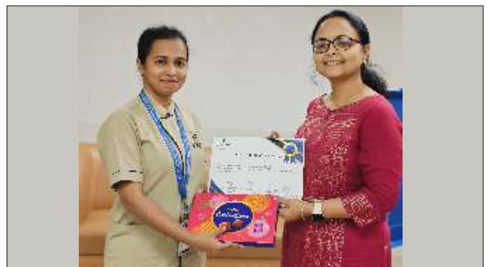
Student Appreciation - Regional

"I am immensely grateful for the education and experiences I gained at Bharati Vidyapeeth College of Nursing, as they have played a pivotal role in my journey to becoming a Nursing Officer at ACTREC Hospital. I carry with me the values and ethics instilled in me during my time at the college, which continue to guide me in providing high-quality care to patients".