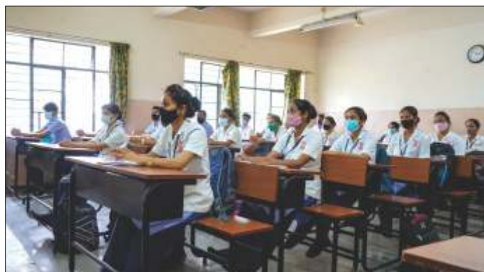
ICT enabled Class Room