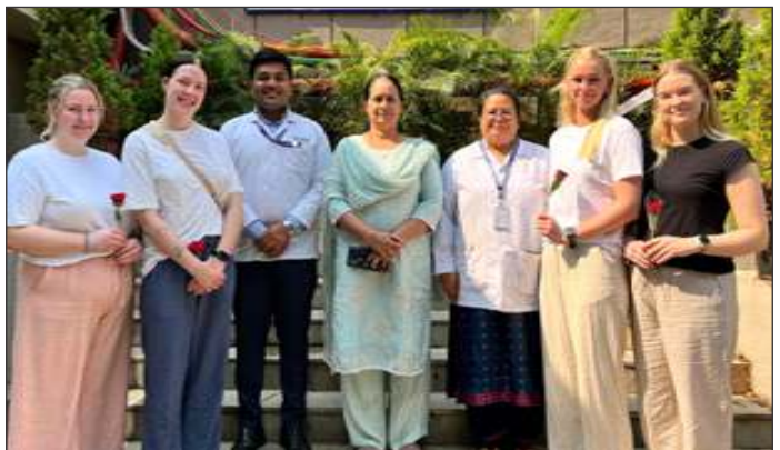
International Students Exchange Programme