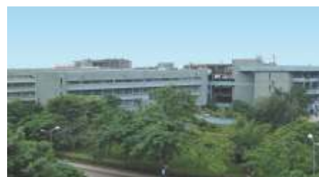
Engineering and Technology