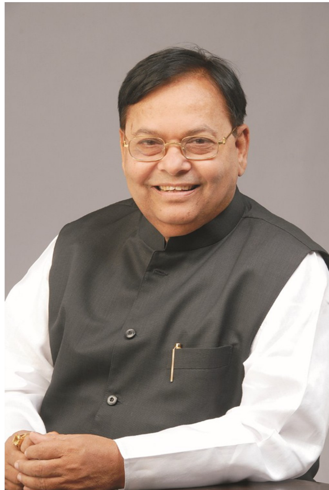
DR. PATANGRAO KADAM Founder, Bharati Vidyapeeth