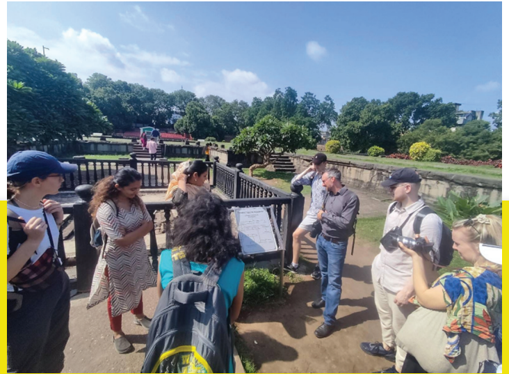
Joint Summer School session at University of Cologne and Bharati Vidyapeeth (Deemed to be) University.