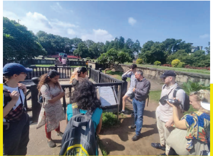
Joint Summer School session at University of Cologne and Bharati Vidyapeeth (Deemed to be) University.