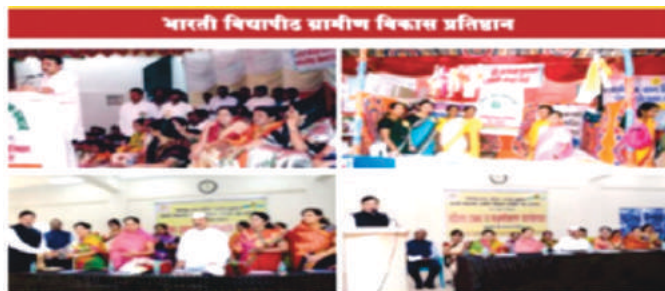
Bharati Vidyapeeth College of Nursing, Navi Mumbai