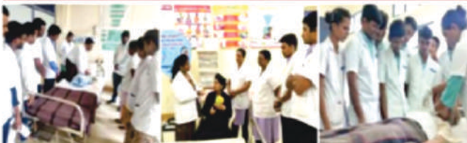
BVDU Institute of Management and Entrepreneurship Development, Pune