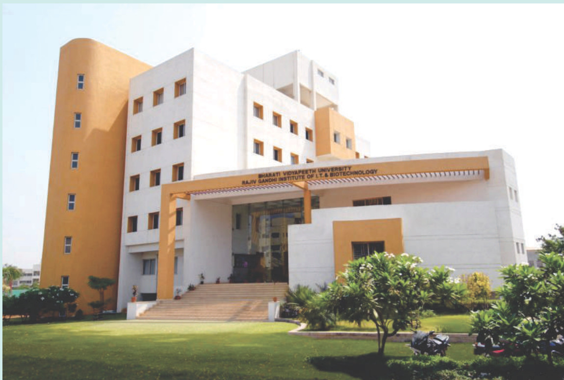
Rajiv Gandhi Institute of I. T. & Biotechnology