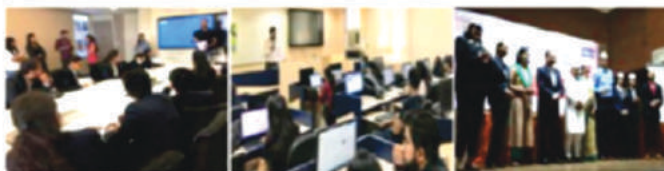
BVDU Rajiv Gandhi Institute of Information Technology & Biotechnology, Pune