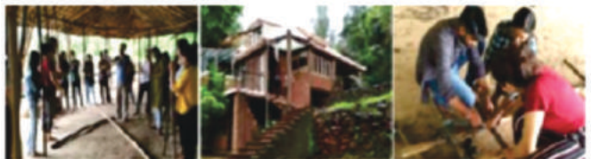
BVDU Dental College & Hospital, Sangli