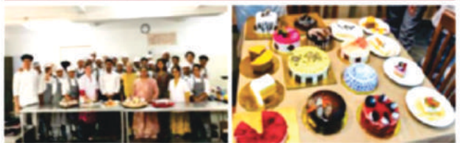
BVDU Medical College & Hospital, Pune