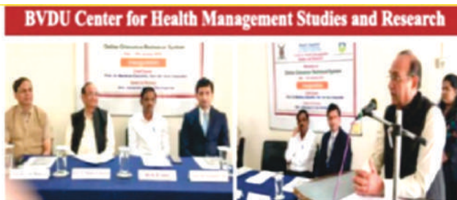
BVDU Poona College of Pharmacy, Pune