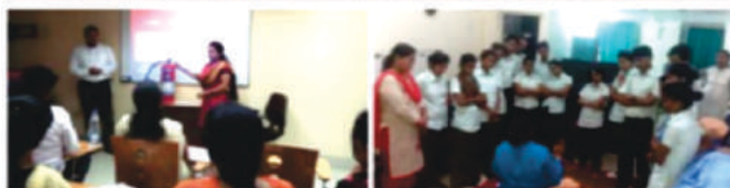
BVDU College of Architecture, Pune