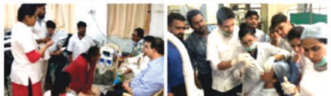
BVDU Institute of Hotel Management and Catering Technology, Pune