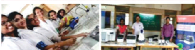
BVDU Medical College & Hospital, Sangli