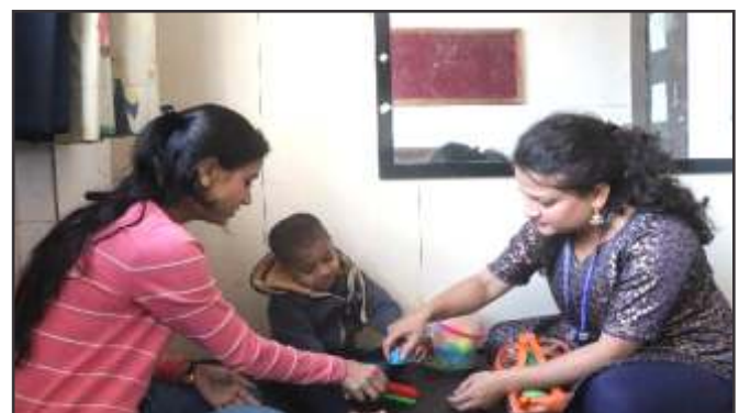
Paediatric Speech and Language Therapy