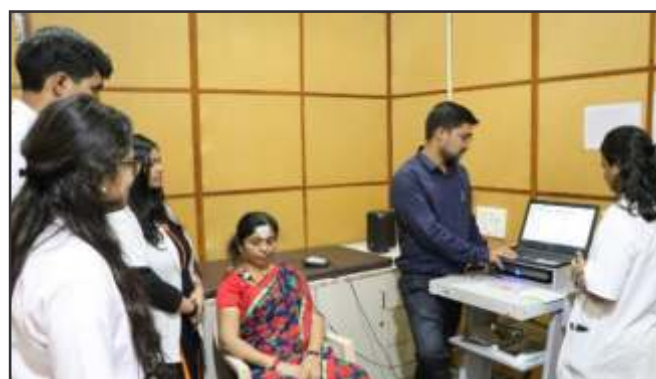
Clinical Teaching in Audiology