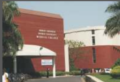
MEDICAL COLLEGE, PUNE