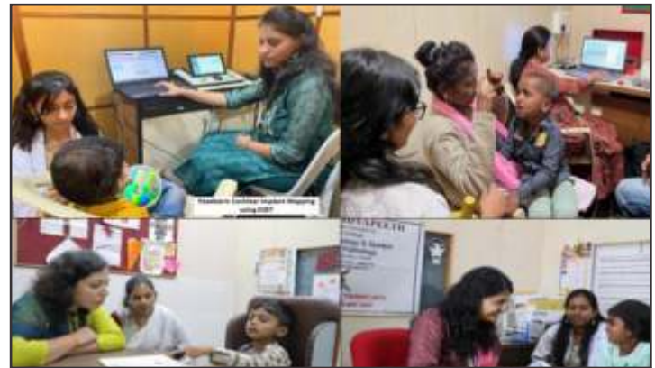
Cochlear Implant Unit