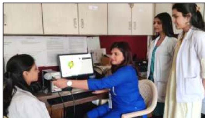
Clinical teaching in Speech Language Pathology