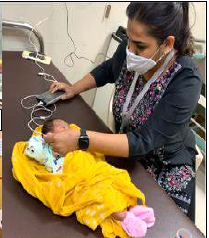
New-born Hearing Screening using Otoacoustic Emissions (OAE)