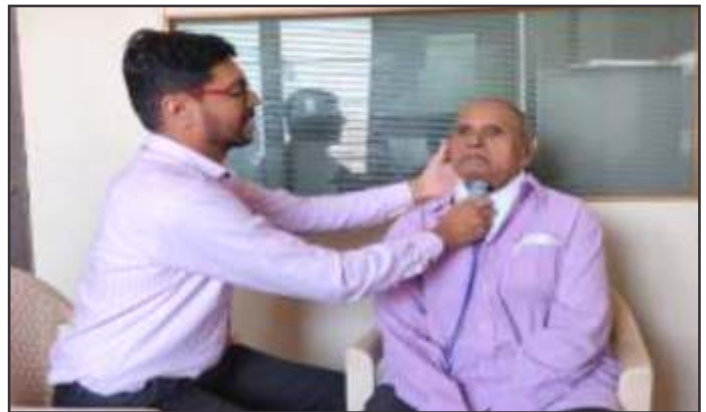
Voice Therapy using Artificial Larynx