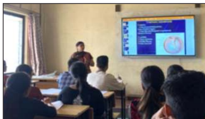
ICT enabled classroom teaching