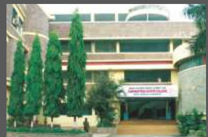
YASHAWANTRAO MOHITE COLLEGE, PUNE