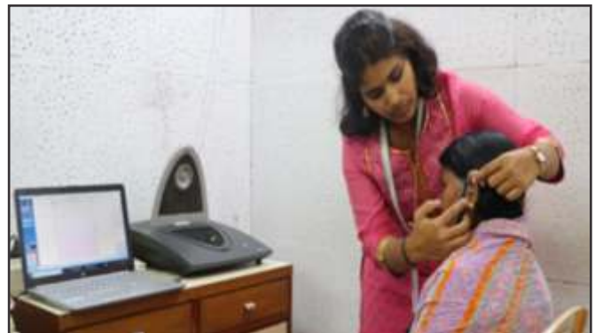
Real Ear Measurement