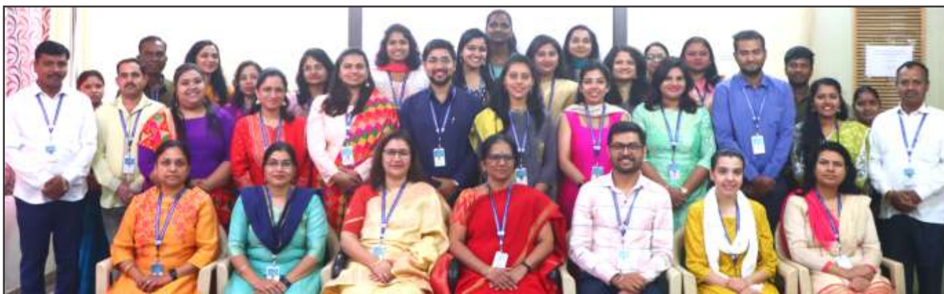
Our capable enthusiastic team: Teaching and Non-teaching staff at SASLP

Speech and Language Pathology deals with the normal and abnormal aspects of voice, speech, language and swallowing. Students of Speech Language Pathology are trained in diagnosis, differential diagnosis and management of speech and language disorders, which includes voice disorders, speech sound disorder, stuttering, speech and language problems associated with hearing impairment, intellectual disability, cerebral palsy, cleft palate, autism spectrum disorders, oral and laryngeal cancers, stroke/ paralysis, and learning disorders.