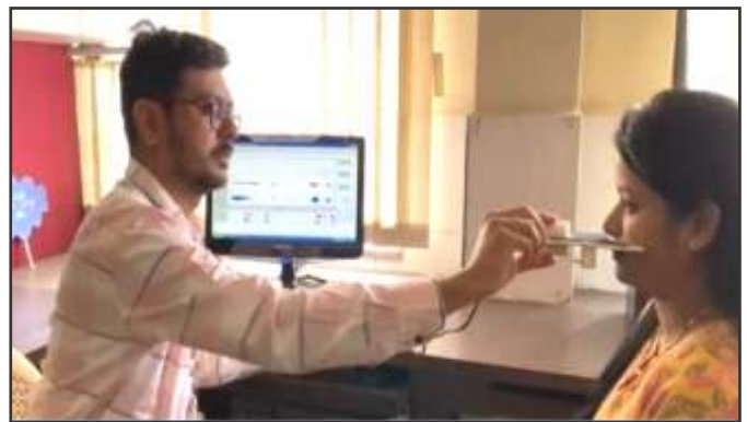
Oral and Nasal Resonance using Nasal View