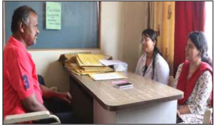
Adult Language Assessment