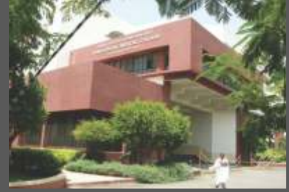
HOMOEOPATHIC MEDICAL COLLEGE, PUNE