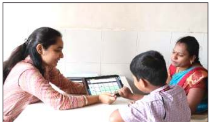
Use of Augmentative and Alternative (AAC) device for paediatric speech and language therapy