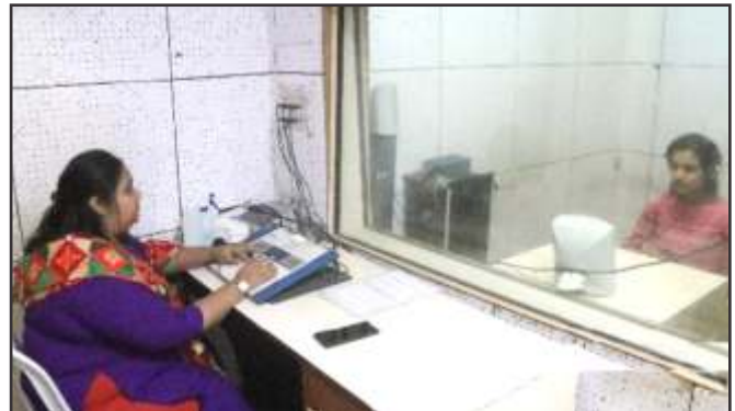
Pure Tone Audiometry