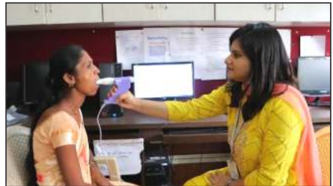
Respiratory analysis using Spirometry