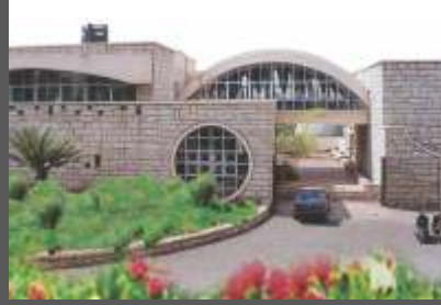
INSTITUTE OF ENVIRONMENT EDUCATION & RESEARCH