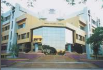
DENTAL COLLEGE & HOSPITAL, PUNE