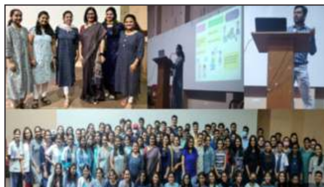
Workshop for students