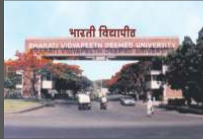
DHANKAWADI CAMPUS GATE, PUNE