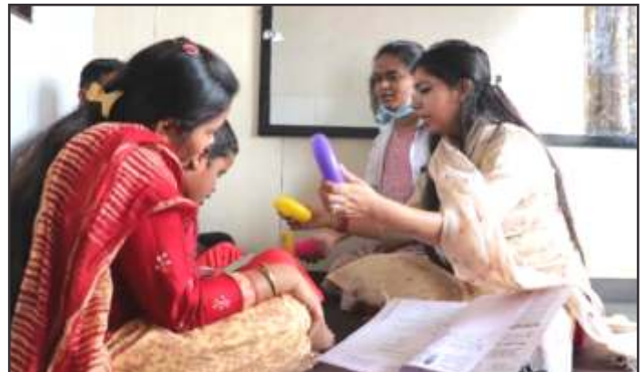
Paediatric Language Assessment at Holistic Outcome Based Planned Early Evaluation and Intervention (HOPE) Clinic