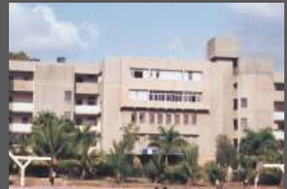
INSTITUTE OF MANAGEMENT AND ENTREPRENEURSHIP DEVELOPMENT, PUNE