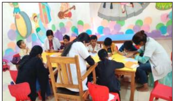
Literacy Intervention to achieve school readiness skills