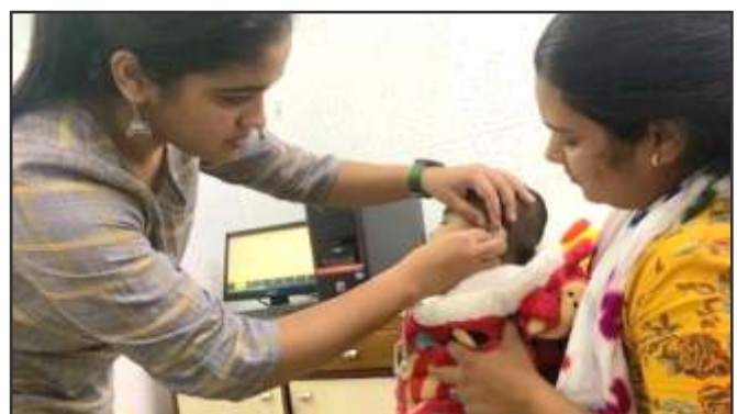
Paediatric Hearing Aid Trial