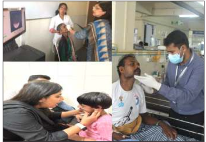
Assessment & Management of Feeding and Swallowing Disorders