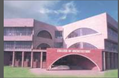
COLLEGE OF ARCHITECTURE, PUNE