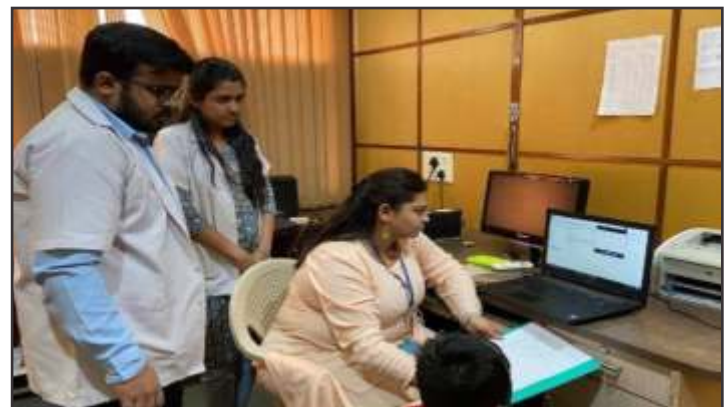
Central Auditory Processing Disorder (CAPD) Evaluation