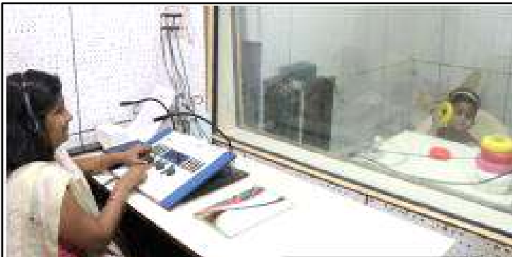
Conditioned Play Audiometry