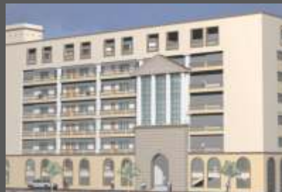
NEW LAW COLLEGE, PUNE