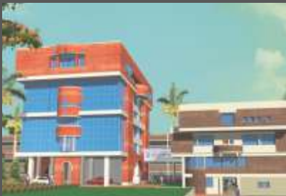
POONA COLLEGE OF PHARMACY, PUNE