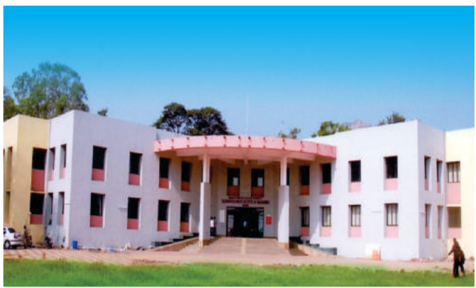
Yashwantrao Mohite Institute of Management, Karad