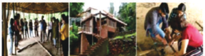
BVDU Dental College & Hospital, Sangli