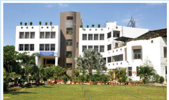
Abhijit Kadam Institute of Management and Social Science, Solapur