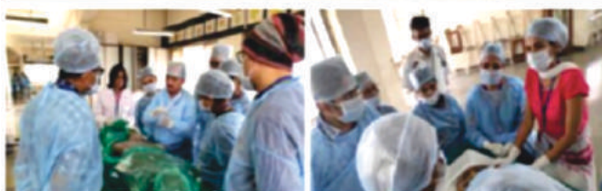
BVDU Medical College & Hospital, Pune