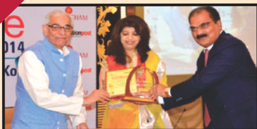
Best Management Institute Award conferred on IMED by ASSOCHAM at the hands of Honble Governor of Gujarat Shri. O P Kohli.