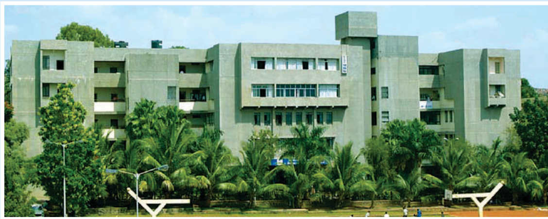
Institute of Management and Entrepreneurship Development, Pune