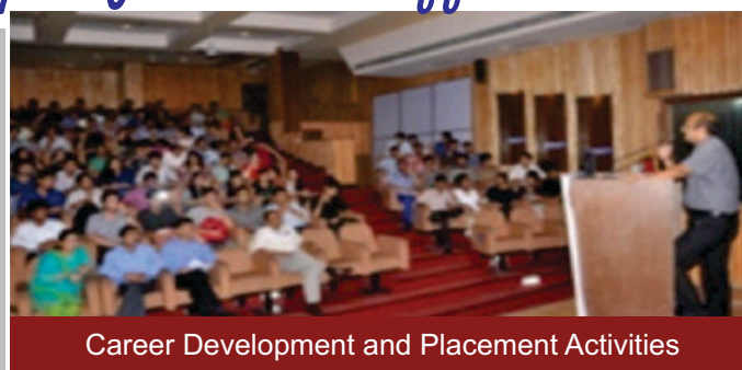
Career Development and Placement Activities