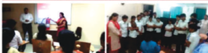
BVDU College of Architecture, Pune