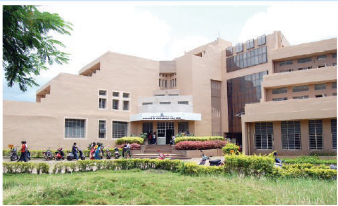
Institute of Management, Kolhapur