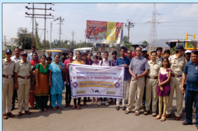
Community Service & Extension Activity (Mass Tree Plantation)