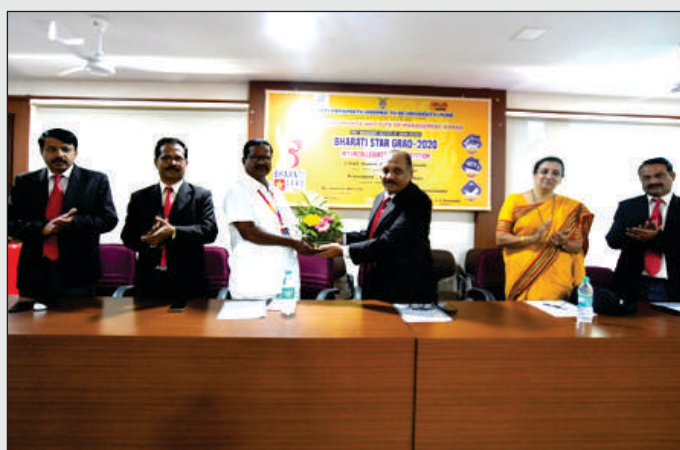
Bharati Star Grad – 2020