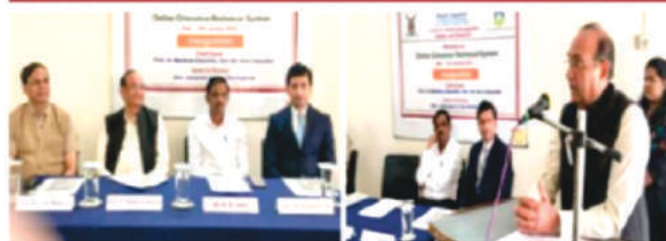
BVDU Poona College of Pharmacy, Pune