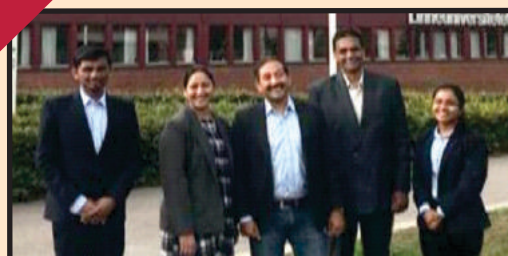
Visit of two Students from IMED Pune to Linnaeus University Sweden for 6 months, as part of the Student Exchange program funded by Swedish Council.