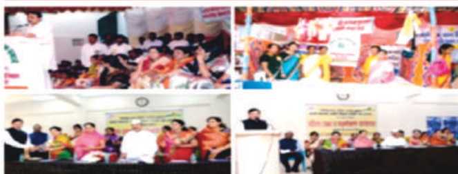
Bharati Vidyapeeth College of Nursing, Navi Mumbai