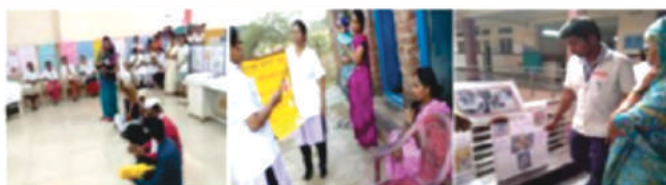
Bharati Vidyapeeth College of Nursing, Sangli