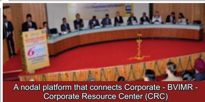
A nodal platform that connects Corporate - BVIMR - Corporate Resource Center (CRC)