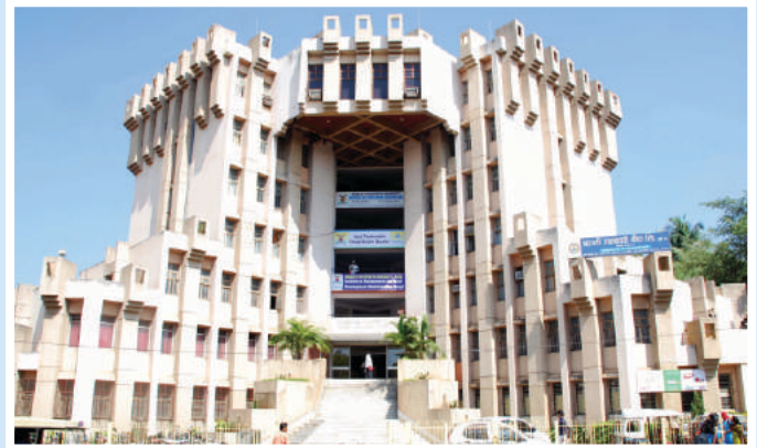
Institute of Management and Rural Development Administration, Sangli