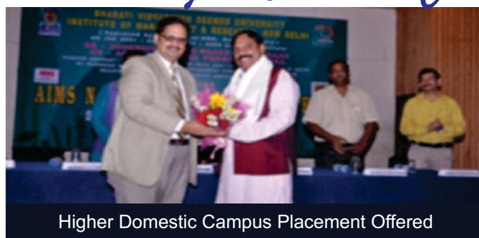
Higher Domestic Campus Placement Offered