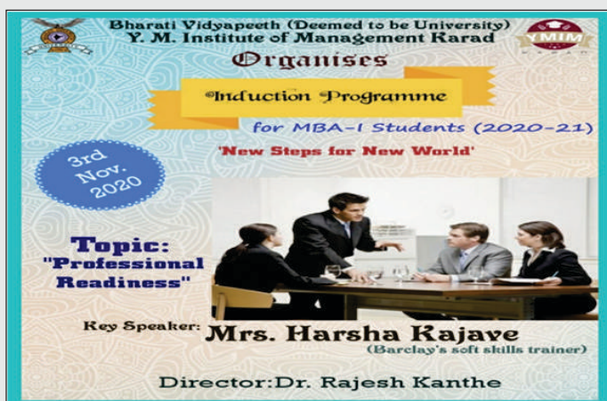
Induction Programme 2020