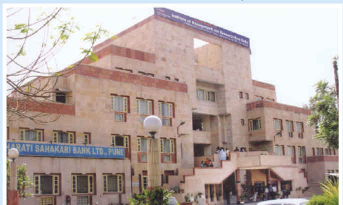
Institute of Management and Research, New Delhi