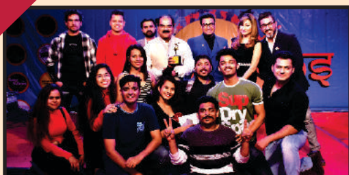
Winners of Expressions International Management & Cultural Festival