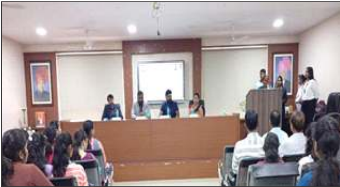
Guest Lecture on - 'Stay Healthy Stay Fit'