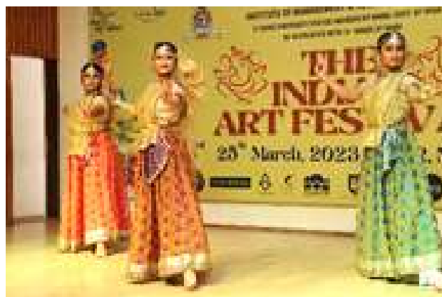
The Indian Art festival – An annual cultural fest