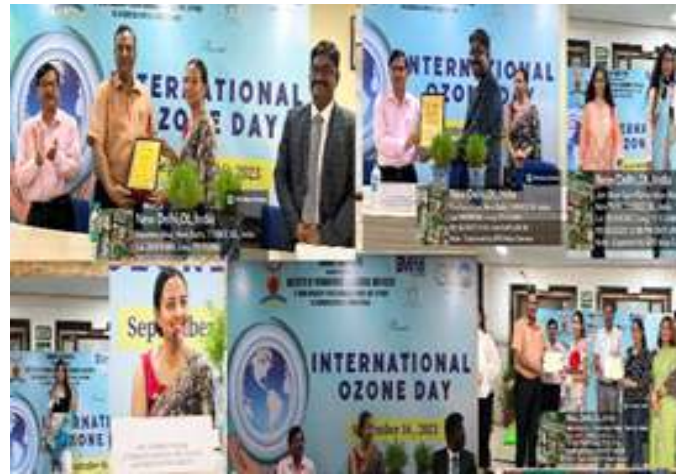
"International Ozone Day" to raise awareness for the preservation of the ozone layer.