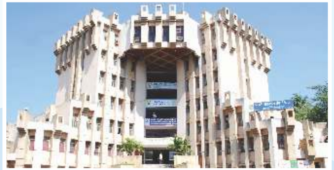
Institute of Management and Rural Development Administration, Sangli