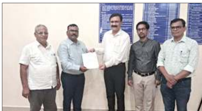
MoU Signed: MoU signed with DAV College, Solapur