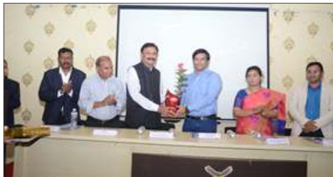
Induction Programme: One Week BBA, BCA Programme Orientation Sessions