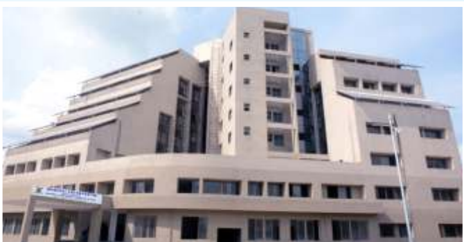
Department of Management Studies, Navi Mumbai