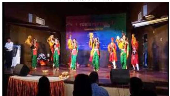
Youth Festival Participation