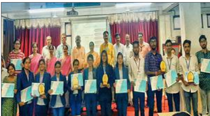
TechnoCraker- Annual Intercollegiate Event