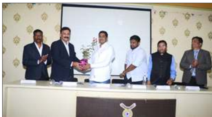
Induction Programme: One Week MBA, BBA Programme Orientation Sessions