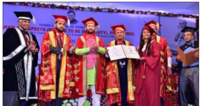
The Best Learning Environment: YMIM KARAD: