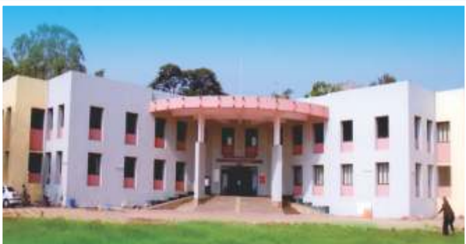
Yashwantrao Mohite Institute of Management, Karad