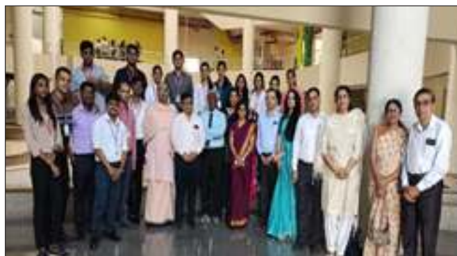
National Youth Day