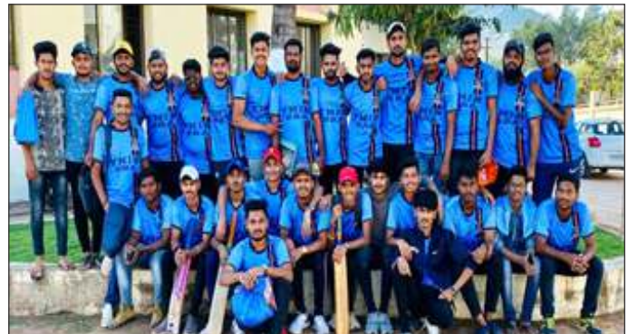
YMIM, Karad Cricket Team