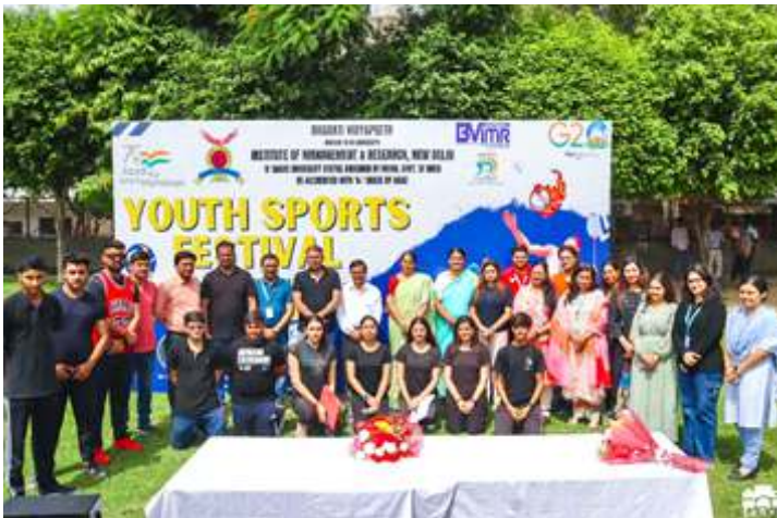
Youth Sports festival- A sports meet organised by Institute