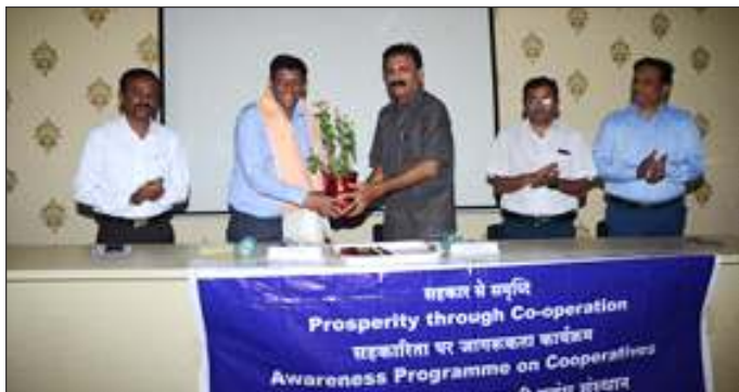
Prosperity through Cooperation: One day Awareness Session on Cooperation