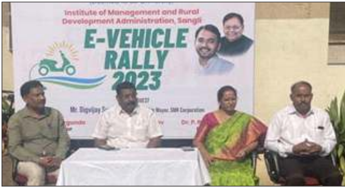
Societal Outreach Programmes Promotion of Clean Environment by using eBikes.