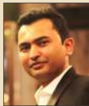
Global Compliance Manager

My experience at IMED was extremely wonderful, especially in the marketing area. Practical examples and cases, which were discussed in the class, are helping me a lot in the Industry.