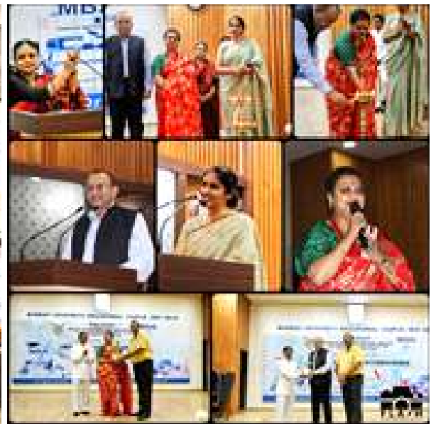
Orientation program for MBA Students