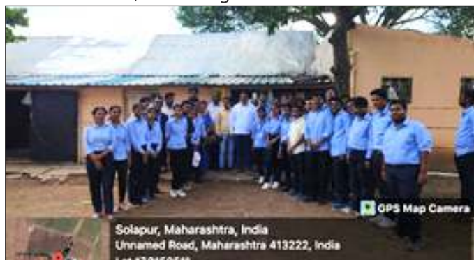
Industrial Visit: visit at Sonaka farm and DKS Poultry farm