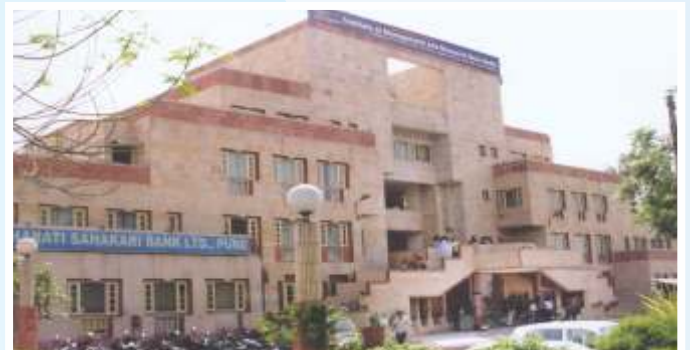
Institute of Management and Research, New Delhi