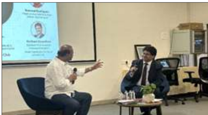
Fireside Chat on Union Budget