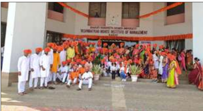
Celebration of Shiv Jayanti