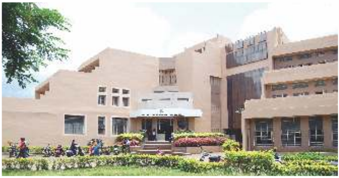
Institute of Management, Kolhapur