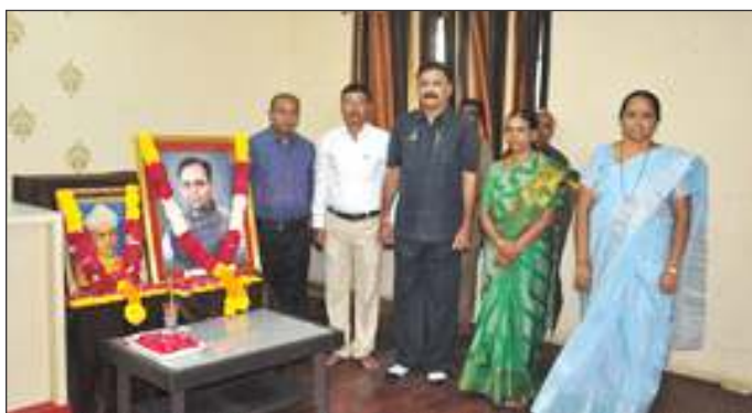
Teacher's Day Celebration