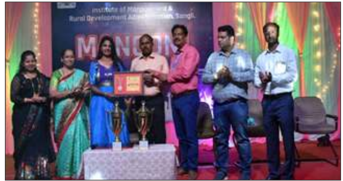
Annual Academic, Cultural and Sports Event- MANCON