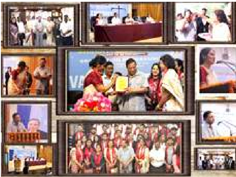
Orientation program for LLB & BALLB students