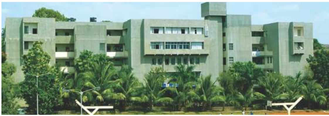
Institute of Management and Entrepreneurship Development, Pune