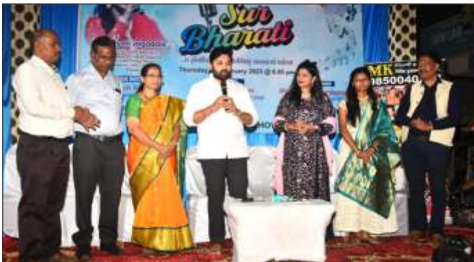
Surbharati- Annual Musical Event