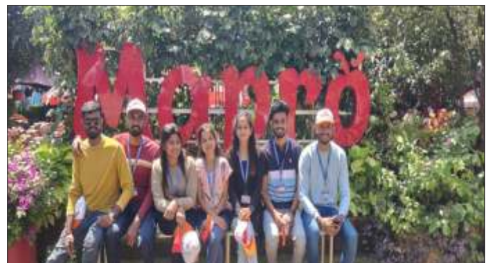
Industrial Visits MBA Sem III visit to MAPRO at WAI Satara District