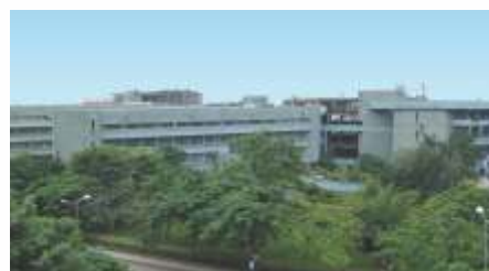
Engineering and Technology