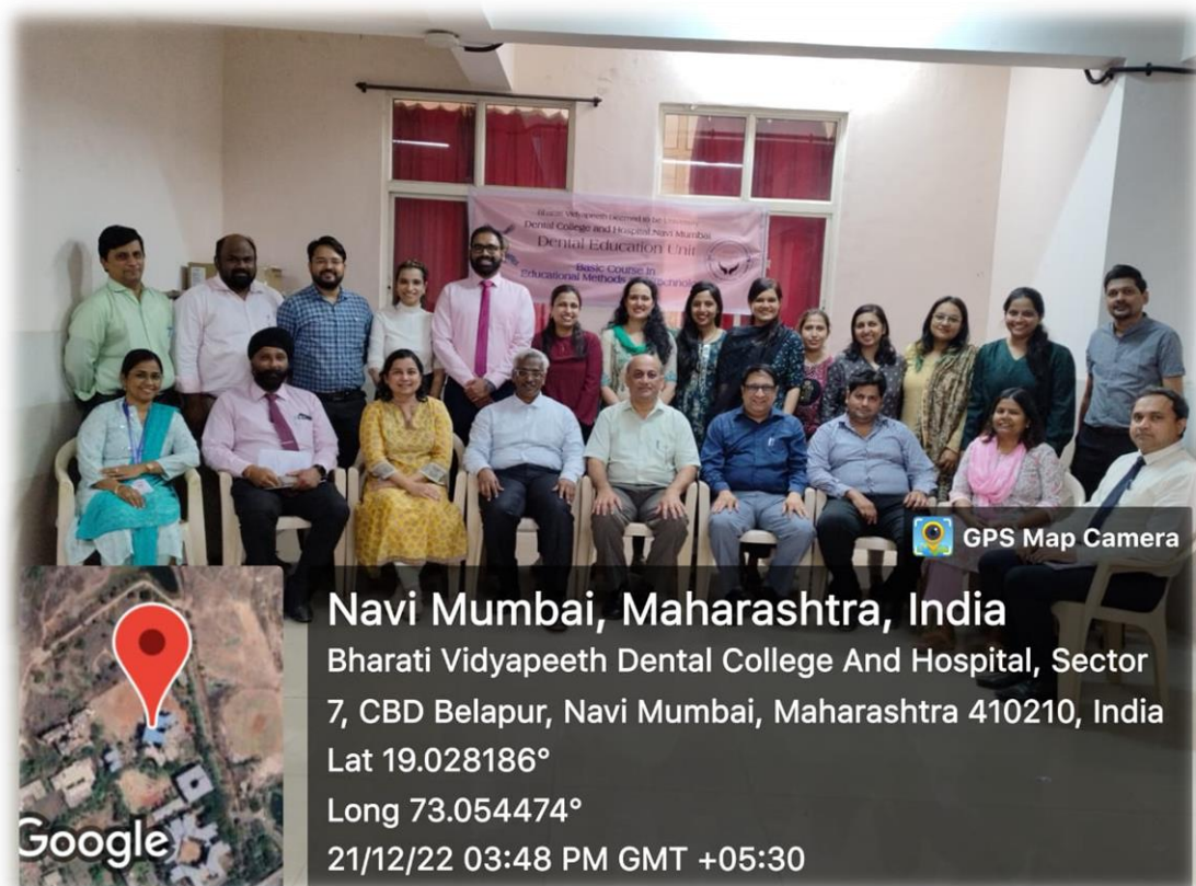
Group Photo of Guest Speaker and DEU Unit Committee members with Participants