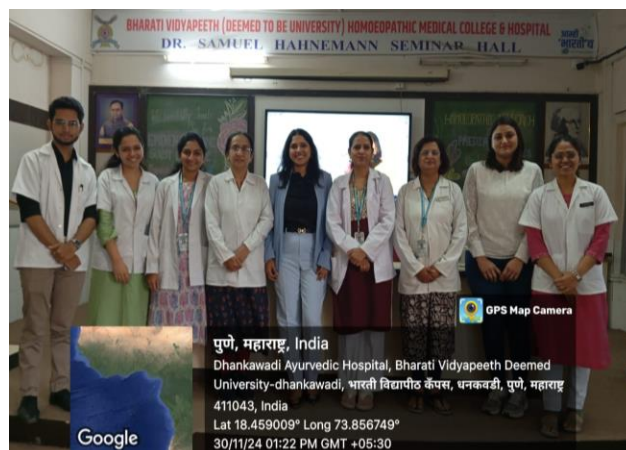
Faculty of Dept. of HMM with the guest speaker and students