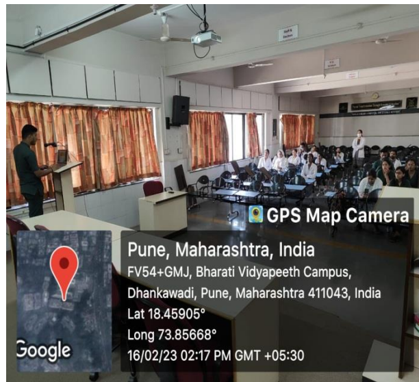
Staff, PG & Interns Attending Clinical Session