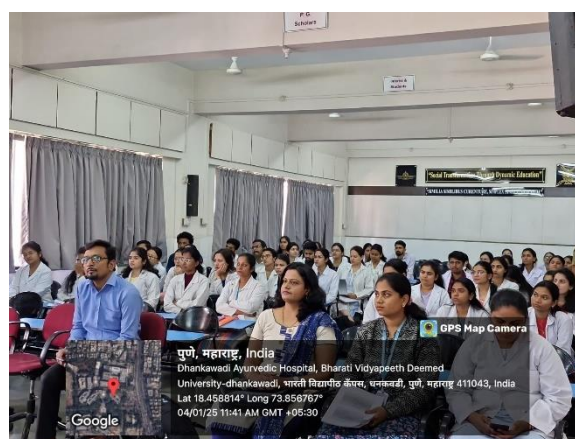
PG Scholars attending the session