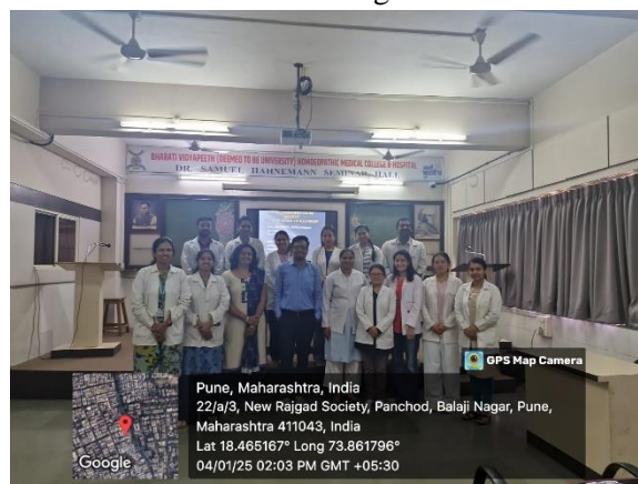
Group photo with Speakers & PG Scholars