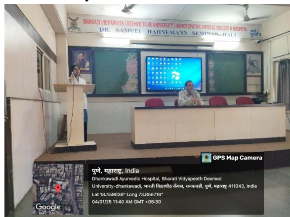
Introduction of the orientation session