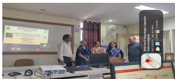
Cleverground & IQAC BVDU Team