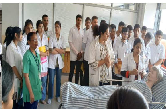
Demo on Mannequin