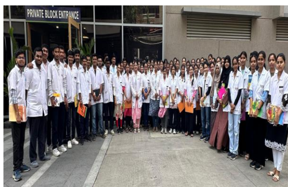
B.H.M.S. students at Bharati Medical Hospital