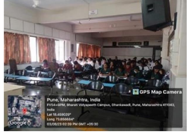
Staff, PG & Interns Attending Clinical session.