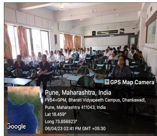
Staff, PG & Interns Attending Clinical Session