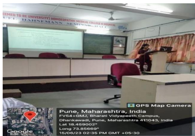
Intern Gayatri presenting the topic Psoriasis