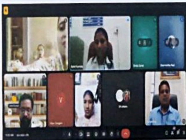
CONDUCTING ONLINE LECTURE