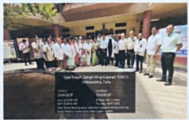
GUESTS AND DIGNITARIES