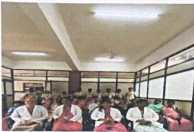
BHARATI HOSPITAL PNC WARD