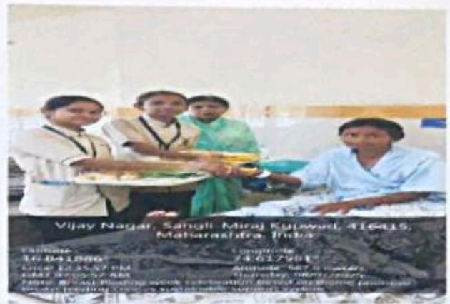
DISTRIBUTION OF FRUITS