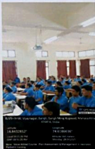
Semester VI th T. Y. B. Sc Students attending value added course.

Pain in neonates is real, significant, and has both immediate and long-term consequences if left unmanaged. Early recognition and accurate assessment using validated pain scales are essential for effective care. A combination of pharmacological and non-pharmacological interventions, tailored to the neonate's condition, ensures safe and holistic management. Involving parents as partners, upholding ethical principles, and practicing cultural sensitivity strengthen the quality of neonatal pain care. Ultimately, comprehensive pain assessment and management not only reduce suffering but also promote optimal growth, development, and overall wellbeing of the newborn.