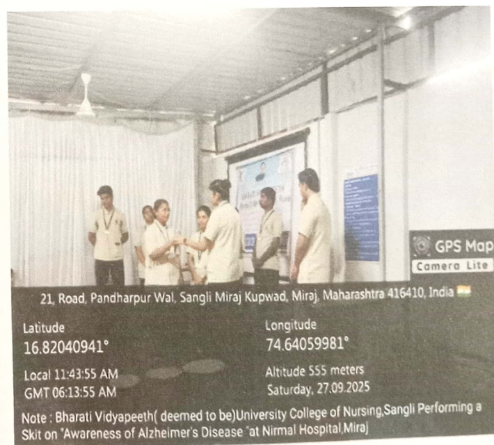
Students performing a skit on World Alzheimer's Day at Nirmal Hospital Miraj.