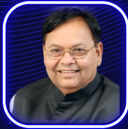
Hon'ble Dr. Patangrao Kadam (Saheb) Founder—Bharati Vidyapeeth, Pune Founder- Chancellor, Bharati Vidyapeeth (Deemed to be University), Pune