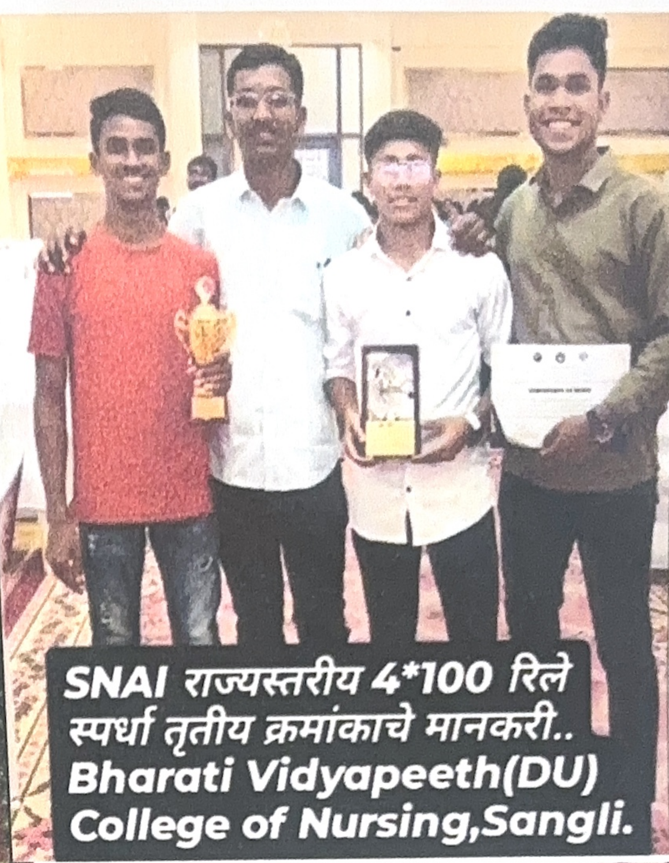
SNAI राज्यस्तरीय 4*100 रिले स्पर्धा तृतीय क्रमांकाचे मानकरी.. Bharati Vidyapeeth(DU) College of Nursing, Sangli.