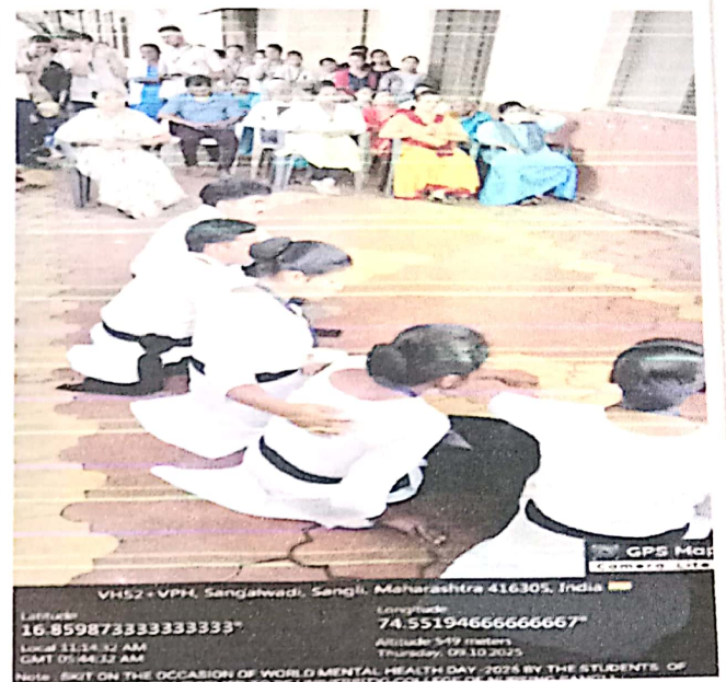
Nursing students performing a skit