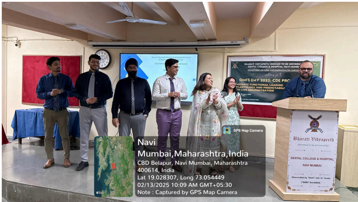
IMAGES EXHIBITING CELEBRATION OF OMFS DAY- CDE PROGRAMME ON 13 TH FEBRUARY 2025