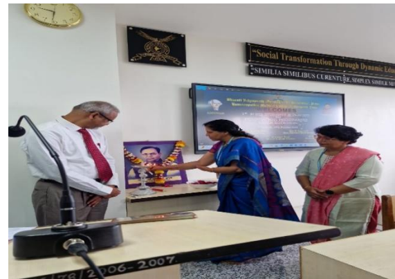
Lamp Lighting by all Dignitaries on induction day of Foundation Program