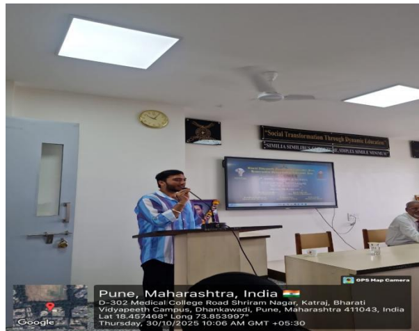
The student shared their excitement.