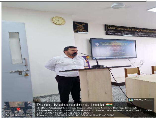
The parent expressed their thoughts.